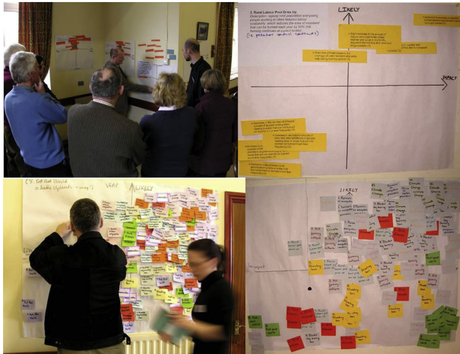
Fig. 2. Likelihood/impact matrix showing examples of the categorisation of scenario components by Nidderdale stakeholders (top left) and Peak District stakeholders (top right); and likelihood/impact matrix showing the categorisation of full scenarios by Nidderdale (bottom left) and Peak District stakeholders (bottom right).

since these were caused by different drivers, with similar effects. Neither of these scenarios were short-listed in the Peak District.