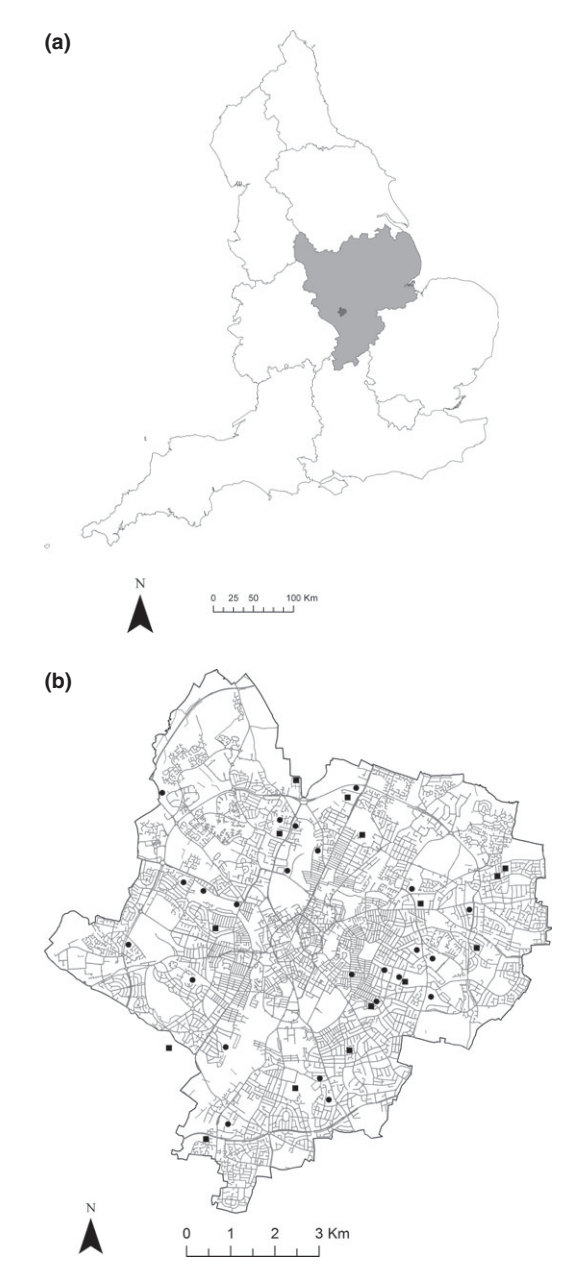
Fig. 1. (a) The geographical location of the East Midlands within England and our study city, Leicester, and (b) the position of allotments within Leicester. Square symbols represent allotment sites sampled; circular symbols are unvisited allotment sites.

Allotment provision in Leicester peaked in the 1930s, with one household in three renting a plot (Crouch & Ward 1997). Today, the city has 46 allotment sites (Fig. 1b), 45 of which are owned by Leicester City Council with 3200 individual plots (Leicester City Council 2012) that in total cover c. 2% of the cities green-space. Within the city, greenspace constitutes 56% of the total area with 32% managed on a small scale privately in domestic gardens, and the remaining 68% is non-domestic greenspace generally managed on a large scale by Leicester City Council or large institutions.