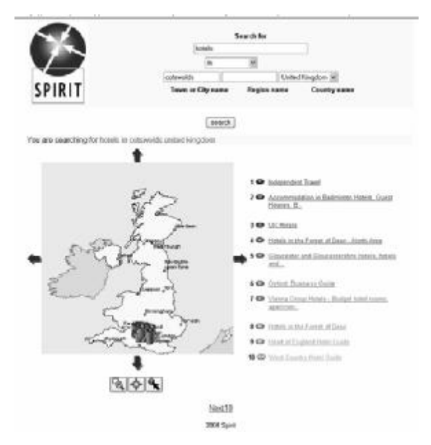
Figure 6 Results of a search using the SPIRIT system for "hotels in Cotswolds"