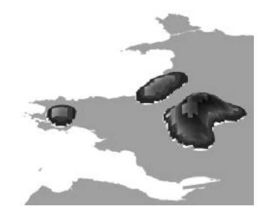
Figure 5 Surface derived for Mid Wales with a threshold of 0.125