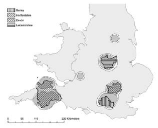
Figure 2 Four precise regions and actual boundaries for two threshold values of derived polygons