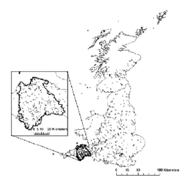
Figure 1 Point set retrieved for top 100 documents for query "~hotels Devon" – boundaries of administrative region corresponding to Devon are shown.