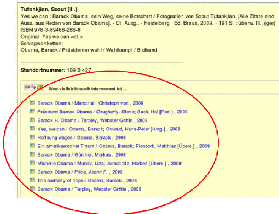
Figure 3: Example of BibTip Recommendations (text translates to "What is also interesting, perhaps...")

A third model for providing OPAC recommendations can be found with Library Thing For Libraries (LTFL). Library Thing is an online service allowing members to catalogue their book collections, and supplement this catalogue with ratings, reviews and tags. With more than a million members, this represents a significant amount of explicit feedback for collaborative filtering recommendations. LTFL is sold to libraries as an OPAC overlay, using a small piece of Javascript to query Library Thing 's database for the ISBN of the item being viewed in the OPAC. Relevant tags, reviews and recommendations are then exported to the OPAC interface and can be viewed by the user (see Figure 3). Since the overlap of the Library Thing aggregated catalogue with University OPACS is around 50%, this offers a readymade means of adding significant value to a large part of the corpus (Westcott et al., 2009). While no research