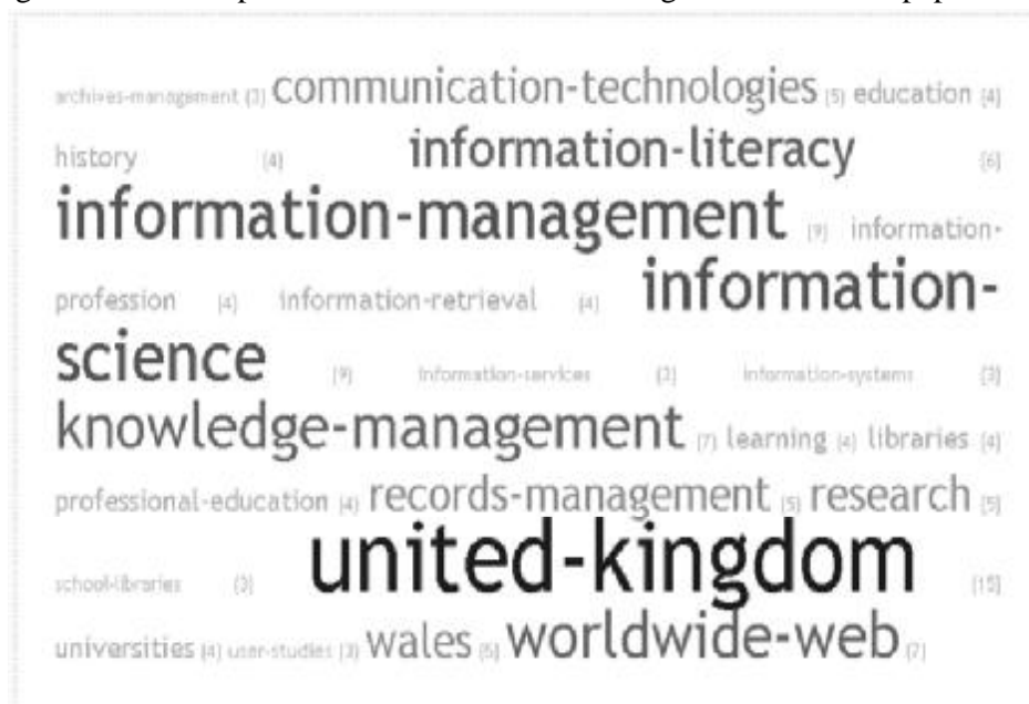
Figure 1. Tag-cloud of key research areas based on Aslib Proceedings special issues.

and Table 6 shows that LIS departments are publishing across these categories: in all there were 2 Uncategorised, 2 Literature Reviews, 4 Viewpoints, 6 General Reviews, 7 Case Studies, 12 Conceptual Papers, 1 Technical Paper, and 38 Research Papers. The presence of only a single Technical Paper would seem to be misleading as nine of those papers classed as