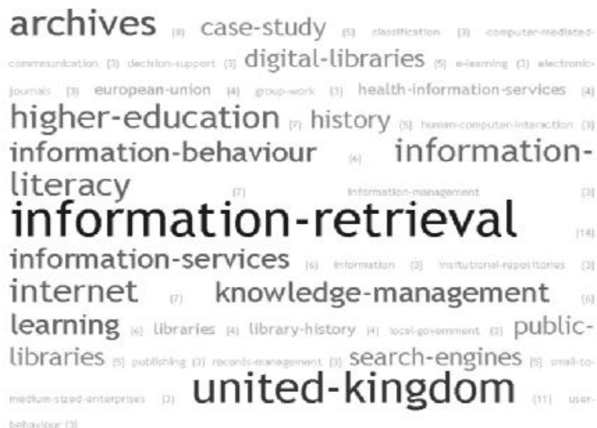
Figure 2. Tag-cloud of keywords extracted from journal articles and Internet publications based on RAE2008 outputs published in 2006-2007

including academic libraries, archives, business, communications, computer science, data management, digital curation, education, electronic environments, geographic information, health information, information, information systems, intelligence, knowledge management,