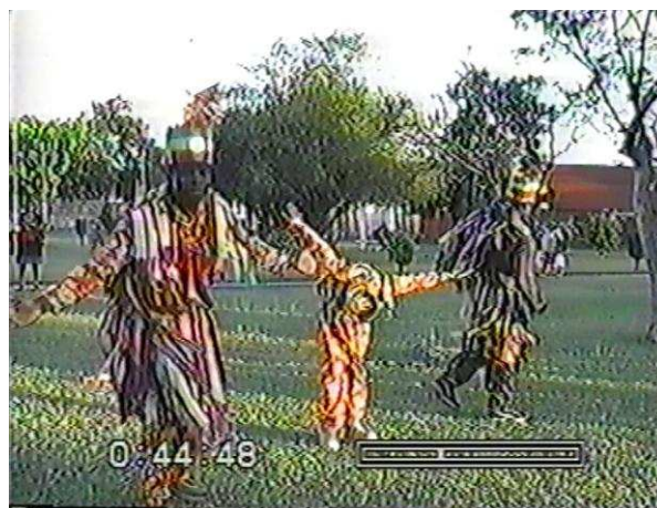
Fig.13 – The end

St. George once again boasts of his prowess as the “chief of all these valiant knights”, and is challenged by Slasher/King of Egypt, who has now become Salabim [sic] – a giant. As before, a whistle terminates their dispute, and more combative dancing takes place. This time there are also solo and three person figures, and much more stick clashing. At one point, they all drop their staves to form a line, and then led by St. George they dance around the performing area. Then there is another set of figures dancing in pairs. Towards the end, all the actors except St. George form a line, initially holding hands, and dance towards him a couple of times. Finally, they all line up holding hands, dance toward the camera and bow extravagantly. It takes two blasts of the whistle before everything ceases.