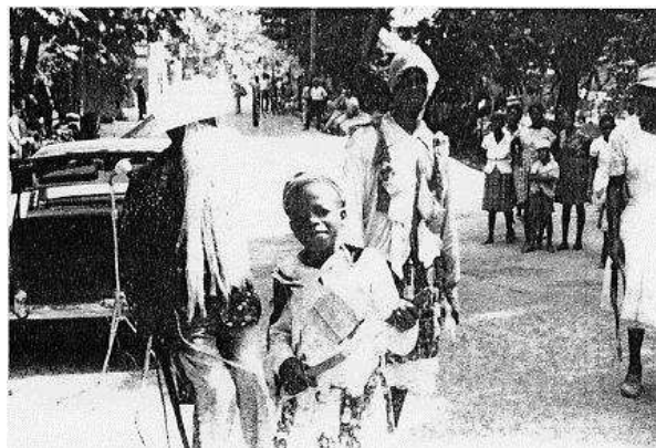
Fig.4 - Queen of Shava, St.Kitts

The scripts collected by Abrahams are quite close to the original Ewing text. They are slightly shorter, having suffered the usual attrition of oral transmission, but the sequence of lines is largely intact, apart from a couple of repetitions. Variations in the words also arise from oral transmission. A few variations are quite radical, and in some cases no longer make sense. It is our observation that the lines that involve unfamiliar concepts and/or use particularly archaic or convoluted language have suffered most, as in the following example spoken by Saint David: