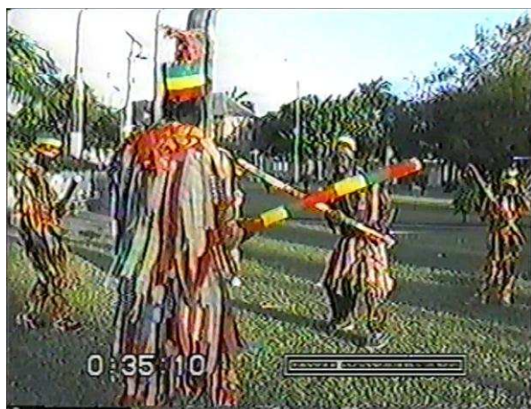
Fig.12 – King of Egypt disputes with St.George