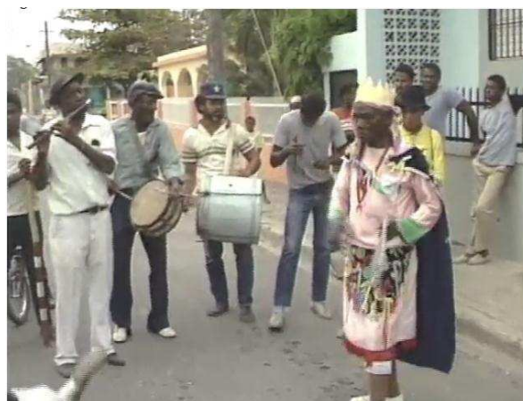
Fig.17 – The band