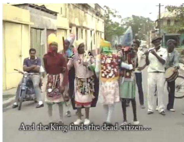
Fig.21 – Female characters (1 & 3 from left)

After the lines spoken by Primo, the dancing resumes (Fig.22) and it is probable that the rest of the play including the action previously described (Figs.14, 20, 21 and 23 below) would have unfolded in between these musical interludes (in accordance with the Roberts recording).