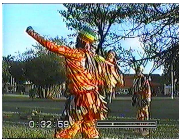
Fig.10 – Second dance - Gyration

Although this is a classic challenge dialogue, there is no fight, except for the ubiquitous clashing of staves mentioned above (Fig.9). The end of what we may call Act One is signalled by a short toot on the fife. The music starts up. The actors drop their staves to the ground, and another series of dances by pairs of actors takes place (Fig.10). This likewise is terminated with a blast of a referee's whistle, and the actors retrieve their staves.