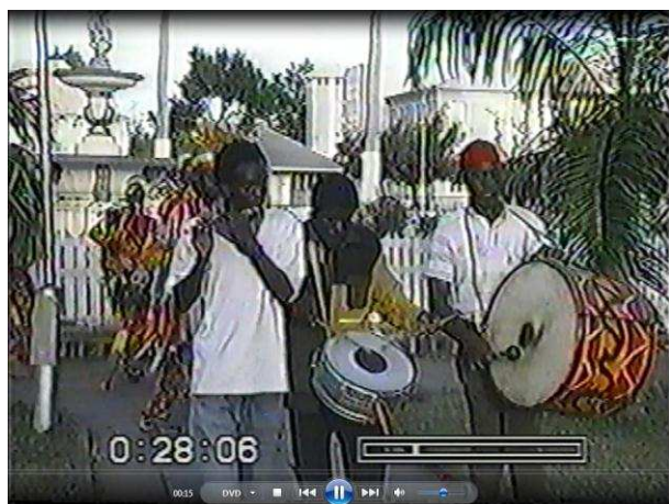
Fig.6 – Entering the square