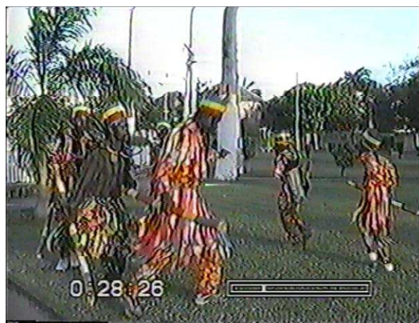
Fig.7 –Circling dance

On leaving the path, the musicians move to one side and back up towards a nearby tree. The dancers, meanwhile, initially dance in a circle, breaking into a sort of trot (Fig.7). They soon move into a line facing the camera and drop their staves to the ground while continuing to dance. The audience is not very apparent; just a few people under the aforementioned tree, although there may have been an audience behind the camera. There immediately follows a series of figures in which pairs of dancers spiral towards each other while dancing a particular move. These moves include, gyrating the hips suggestively, hopping on one leg with the other leg extended forward (Fig.8), a sort of backwards run, hopping alternately with the legs to the side to achieve a swaying effect, hopping on one leg while turning the other foot through 180 degrees as in The Twist , and so on.