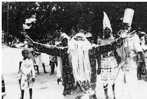
Fig.3 - Father Christmas, St.Kitts

dressing according to part. The other characters, however, wear fairly simple nonrepresentational costumes, covered in handkerchiefs or pieces of cloth, with prominent headgear of various shapes. A couple of these hats are quite tall.