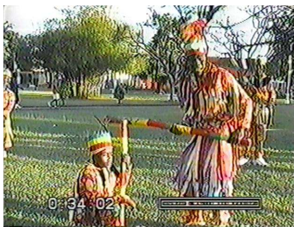
Fig.11 – The fallen Black Prince of Paradise

This time there is no introductory round of stick clashing before the speeches commence. St. George announces the death of the Black Prince of Paradise, signals for one of the boys to kneel in the middle of the circle, which he does with his staff placed vertically on the ground (Fig.11), and then calls for him to be taken away. The delivery continues with his habitual stick clashing with other cast members after every line or two. The King of Egypt (the actor who was Slasher earlier) enters, seeking his son. St. George gives him the bad news. Their dialogue becomes a dispute (Fig.12), during which the Black Prince of Paradise rises back into line, and at the point where a combat would ensue, the whistle blows again for another round of dancing. In this case the dance incorporates two short stick clashing duels. A whistle ends the dancing.