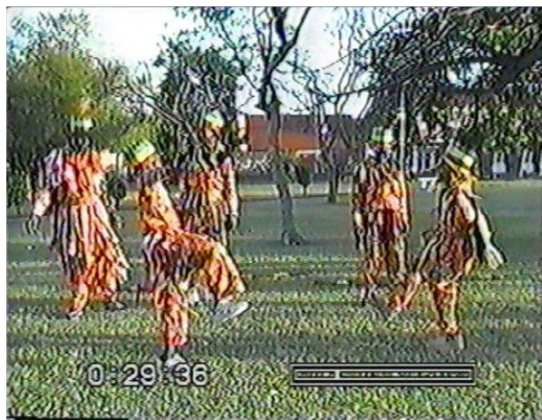
Fig.8 – Pair from the first dance

On leaving the path, the musicians move to one side and back up towards a nearby tree. The dancers, meanwhile, initially dance in a circle, breaking into a sort of trot (Fig.7). They soon move into a line facing the camera and drop their staves to the ground while continuing to dance. The audience is not very apparent; just a few people under the aforementioned tree, although there may have been an audience behind the camera. There immediately follows a series of figures in which pairs of dancers spiral towards each other while dancing a particular move. These moves include, gyrating the hips suggestively, hopping on one leg with the other leg extended forward (Fig.8), a sort of backwards run, hopping alternately with the legs to the side to achieve a swaying effect, hopping on one leg while turning the other foot through 180 degrees as in The Twist , and so on.