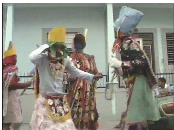
Fig.22 – Dancing resumes

After the lines spoken by Primo, the dancing resumes (Fig.22) and it is probable that the rest of the play including the action previously described (Figs.14, 20, 21 and 23 below) would have unfolded in between these musical interludes (in accordance with the Roberts recording).