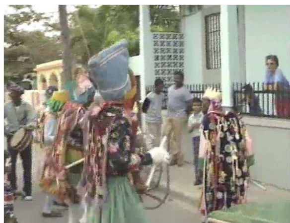
Fig.16 – Lining up in front of a house

“Mummies is a game that has a cast of a Giant, a Doctor and a King. It so happens that the Giant kills a citizen who is walking on a bridge... And the King finds the dead citizen... And he wants the Giant, as an order to bring to life the dead... In the middle of this, a Doctor, in a horse, appears... And the Doctor gives a medication to the dead that is already dead... And bring him to life! And they fight clubbing each other... And the King kills the Giant... In between dances, they do different choreography... It is very beautiful!”