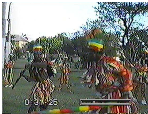
Fig.9 - St. George and Slasher clash staves

The end of the dancing is signalled with a blast on a football referee’s whistle. The musicians stop playing, and the actors pick up their staves and form a semicircle. The first actor (named St. George later in the play, but here with the lines of St.David quoted above) goes round all the other actors in no apparent order and gives their staves a mighty thwack with his own. He then declaims his speech, issuing a challenge to the “bravely soldier”, which is answered by