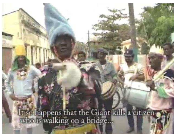
Fig.20 – The Giant