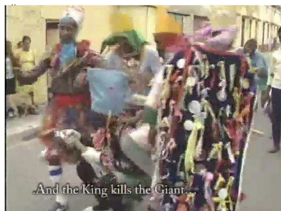
Fig.23 – The Giant killed

The costumes are richly decorated with mirrors and beads. It was remembered with pride by older members of the Cocolo community that they were able to create more impressive costumes with their greater resources in the Dominican Republic than was possible in their islands of origin.