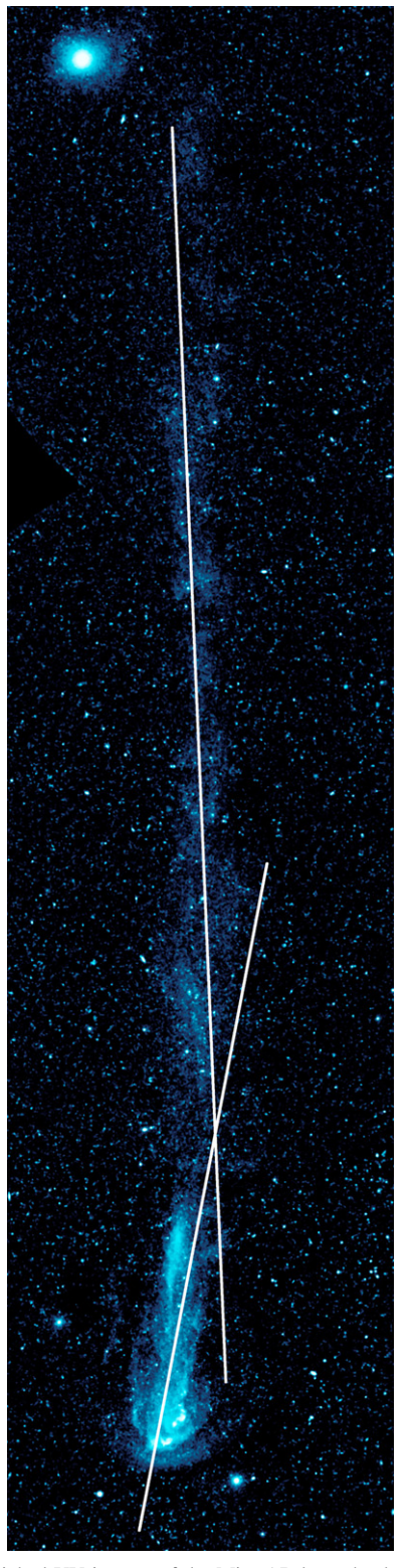
Figure 1. Mosaicked UV images of the Mira AB bow shock and tail system. This figure is an adaptation of Figure 1(a) from Martin et al. (2007). The two lines indicate the change of alignment in the tail. The bright star close to the termination point of the tail is HR 691.

(A color version of this figure is available in the online journal.)