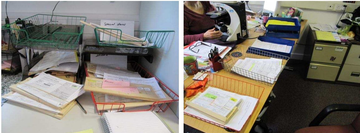
Fig. 3: Document trays for organising cases

On his desk, CH8 has a number of trays for organising his work, including an 'in tray'. One labelled 'special stains' contains cases where CH8 is 'waiting for stuff', e.g. waiting for additional slides, waiting for slides from the archive. Having sorted through his pile of cases, CH8 puts the non-urgent ones in the back of his in tray, while the high priority cases sit in a pile on his desk, so that he can start with those. The cases that he has finished with – he has authorised and finished the paperwork – sit in a tray on the floor. CH8 also has an additional tray on his desk for when things get busy.