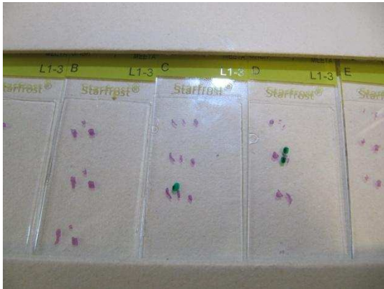
Fig. 6: Annotating areas of concern

'I'm going to put a dot next to them because this will be reviewed at the MDT meeting [marks areas of concern with a pen]. So that will save whoever's doing the review, it won't be me because I don't go to that meeting, so that person can find my dots and not have to spend a lot of time reviewing the case in its entirety.' (CH3)