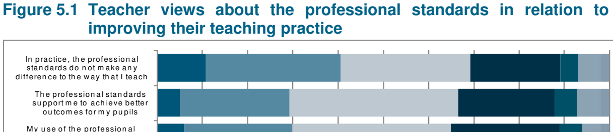
standards has already helped me to improve my teaching I use the professional standards to identify CPD objectives to help me improve my teaching I use the professional standards to help me identify where I want to improve my teaching The professional standards provide a good definition of teacher competence I have a good understanding of the professional standards for teachers 0% 10% 20% 30% 40% 50% 60% 70% 80% 90% 100% ■Strongly Agree ■Agree ■Neither agree nor disagree ■Disagree ■Strongly Disagree ■Don't know ■No response

It seems that the professional standards provide a useful conceptual or definitional benchmark for a majority of teachers, but when it comes to assessing the practical impact of the standards upon their teaching or upon pupil outcomes, teachers are not as certain about their influence. This was demonstrated by the finding that around a third of respondents neither agreed nor disagreed with five of the seven statements about the standards, as illustrated in Figure 5.1. This may be explained by teachers not having used the standards and therefore being unable to respond to the statements, or it may be that teachers are simply attributing greater importance to other influences on changing their teaching practice.