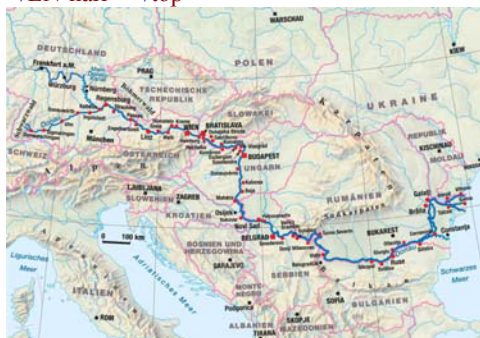
Figure 1: Danube river map

<EN-narr>Relevant documents should contain at least a short description of cities through which the rivers Danube and Rhine pass, providing evidence for it. The Danube flows through nine countries (Germany, Austria, Slovakia, Hungary, Croatia, Serbia, Bulgaria, Romania, and Ukraine). Countries along the Rhine are Liechtenstein, Austria, Germany, France, the Netherlands and Switzerland</EN-narr> </top>