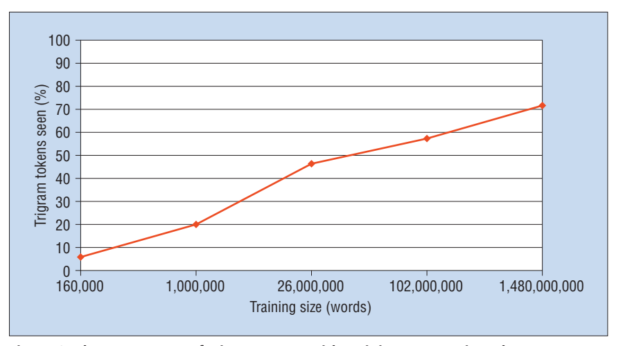
Figure 2. The percentage of trigrams seen with training-corpus size. The percentage grows linearly with the training-corpus size.

Adam Kilgarriff and Gregory Grefenstette were among the first to point out that the Web itself can now become a language corpus in principle, even though that corpus is far larger than any human could read in a lifetime.<sup>33</sup> A rough computation shows that a person would need about 60,000 years to read all the English documents now on the Web. But the issue here isn't building a psychological model of an individual, so this