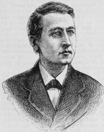
Thomas A. Edison.

success, and even obtained notice from the "Times," as being the only newspaper published and printed in a train.