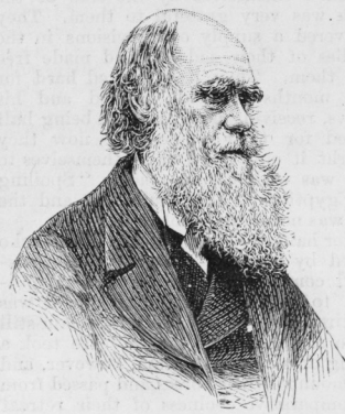
The late Charles Darwin.

periodicals, or fruit for sale to the passengers. Being very successful in this avocation, he formed the idea of printing a weekly paper in the