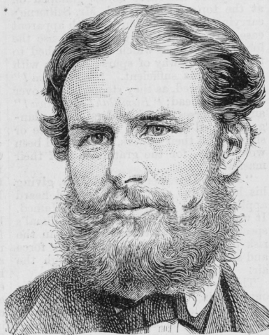
Sir John Lubbock, Bart., M.P., F.R.S.