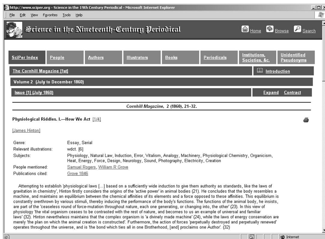
Figure 3. Screenshot from 'Science in the Nineteenth-Century Periodical: An Electronic Index' http://www.sciper.org

by a complex search facility, using the full range of indexed fields to permit highly sophisticated searches. Thus, the researcher can search for all fictional articles relating to botany written by women born between 1800 and 1850 – and indeed there are some!