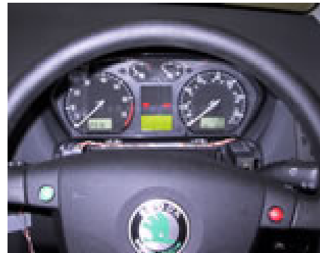
Figure 8: Intelligent Speed Adaptation Car Dashboard

One of the biggest applications of global positioning systems for improved road safety is in the development and deployment of Intelligent Speed Adaptation (ISA) systems to enforce legal speed limits through vehicle speed limiter control (Univ. of Leeds, 2006). This controversial system has the potential to make the largest impact on safety since the introduction of seat belts, and could also render physical traffic calming, such as road humps and chicanes, totally obsolete. Trial systems are currently undergoing testing in the UK with a fleet of Skoda Fabia cars, which cannot exceed the national speed limits of local roads. A similar set of trials have been conducted in Scandinavia. The system is also flexible enough to be linked to remote sensors and used to control speeds due to adverse weather conditions or changes in traffic volume, thus providing for a range of variable speed limits to safely suit the travel circumstances. Predicted savings in the number of accidents have been estimated to be a 36% reduction in personal injury accidents and a 58% reduction in fatalities. The system could be operational by the year 2020, but is subject to public acceptance and appropriate government legislation.