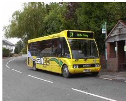
Figure 6: Demand Responsive Vehicle, UK.

However, provision of such services is not cheap. Schemes have none the less been initiated in the UK, Finland and Italy.