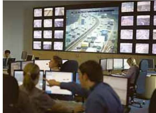
Figure 4: Urban Traffic Control Centre – UK Highways Agency

The successful management of traffic in towns and cities and inter-road networks across Europe is of paramount importance to ensure that economic growth is maintained and that quality of life is good. Business depends upon the efficient movement of goods and people within and across borders. The European Commission's White Paper on European Transport Policy (2001), clearly stipulates that satellite technology will play an increasingly important role in providing accurate traffic and incident data and will aid the planning of services and operations in the future (EC-DGTREN, 2001a). Across Europe traffic control centres are appearing, as evidenced with the National Traffic Control and Regional Control centres which have recently been opened by the UK Highways Agency. Although a great deal of information is collected via roadside sensors and CCTV cameras, an increasing opportunity exists to make use of floating vehicle data, by monitoring the position and progress of vehicles in a network using satellite tracking technology. In this manner control and response to changes in flows and incidents can be responded to quickly and effectively.