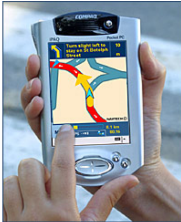
Figure 9: Hand-Held PDA with Personal Route Guidance System

Currently there are 37 million people in Europe with some form of disability making independent travel a real issue of difficulty (EC-DGTREN, 2006). There is a genuine need to improve services and provide usable transport systems for these people. Disabled and blind citizens will benefit from the development of practicable and affordable personalised guidance and locational information systems. The precise matching of personal location with point of interest information becomes essential for successful and usable systems to advise and navigate blind travellers. For those with disabilities requiring access to special transport facilities, such as lifts, escalators and flat or ramped surfaces, careful route planning and notification is required. Indeed through the development of such systems for people with special needs, this will lead to benefits for all travellers, who will be