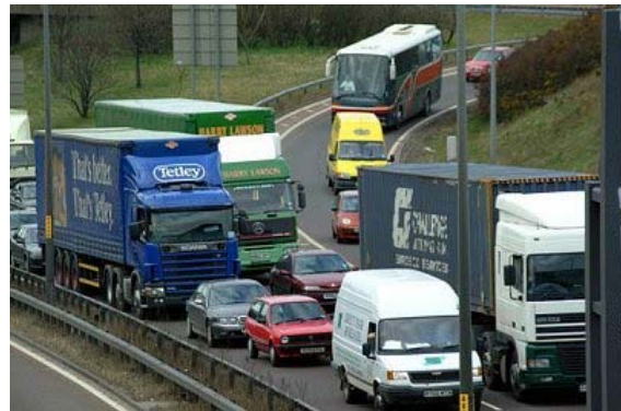
Figure 1: Traffic Congestion

The development, deployment, and continual enhancement of the Global Navigation Satellite System (GNSS) has been of great significance to the design and development of Intelligent Transport Systems (ITS) in recent years. Further enhancements of navigation technology will develop existing and encourage new intelligent transportation systems worldwide. European countries have been at the forefront of research and implementation of ITS technologies over the past decade, to assist with traffic management and provide accurate up to date information to travellers using all modes of transport. ITS applications have been designed and implemented to tackle the growth in traffic congestion, save valuable resources, help protect the environment and provide an equitable and sustainable transport network to aid the mobility of people and goods.