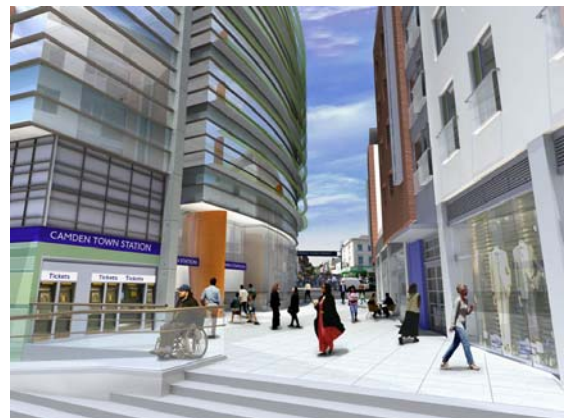
Figure 10: Mobile GPS – location based services for pedestrian navigation in urban zones

able to obtain navigational advice and guidance when in urban areas and even inside buildings, such as indoor shopping malls and large department stores. Personal navigation systems are already available and will become a great deal more accurate with satellite navigation enhancement in the next few years, as GALILEO will allow for better coverage than has previously been possible.