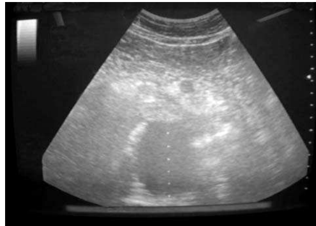
Figure 3 Case 5, 6 cm AAA.