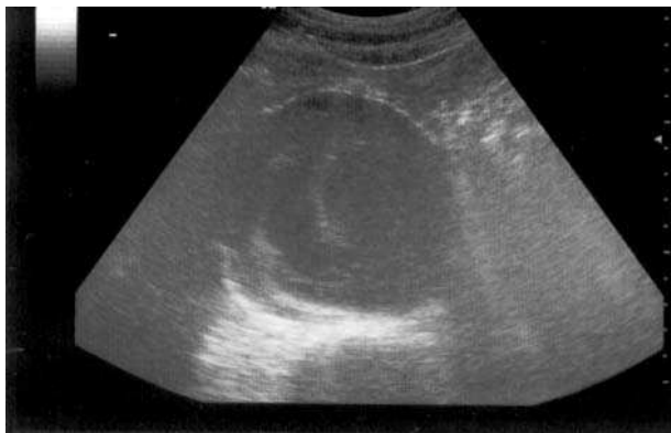
Figure 2 Case 2, 7 cm AAA.

A 67 year old man had experienced abdominal and back pain overnight, in association with diarrhoea. He was hypotensive on arrival and a 7 cm AAA was discovered when an emergency physician performed ultrasound in the resuscitation room. He was transferred to the operating theatre and survived the repair but died three days after operation.