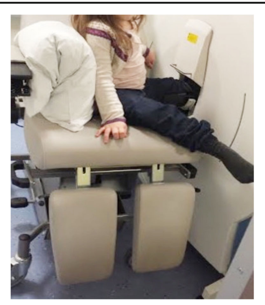
Fig. 1 Clinical photograph of a 9-year-old girl with osteogenesis imperfecta. The chair had to be turned by 90° and extra pillows placed along the arm rest to adequately position her for scanning of her distal tibia

The principal aim of this study was to investigate the feasibility of high-resolution peripheral quantitative CT imaging for