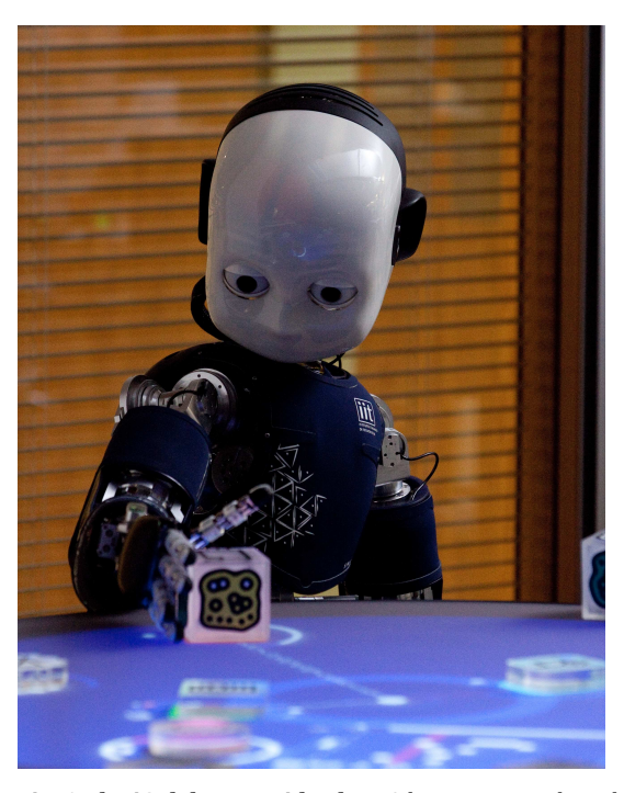
Fig. 1 The iCub humanoid robot. A biomimetic robot platform for embodied testing of theories of general human intelligence developed by European researchers led by the Italian Institute of Technology. Picture from Sheffield Robotics.

DAC is a high-level conceptual scheme that seeks to capture the cognitive architecture of the human brain and consists of four tightly coupled layers: soma , reactive , adaptive and contextual . Across these layers, there are three functional columns of organization: The first comprises the sensory, perceptual and memory sub-systems relating to the world , the second the interoceptive, motivational and memory sub-systems related to the self , and the third sub-systems that operate on the world through action . These DAC sub-systems do not directly map on to specific neural substrates, however, significant progress has been made relating parts of the DAC architecture to different brain sub-systems and circuits [47, 69]. Recent efforts to create a multi-faceted robot sense of self for iCub, using DAC, are detailed in [39]; here, we briefly summarize the architecture and some of the self-related capabilities it enables.