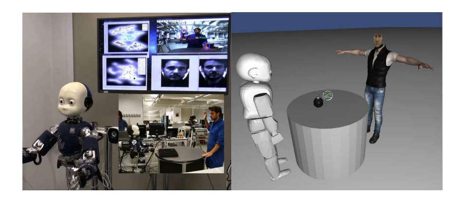
Fig. 2 The synthetic event memory system developed at Sheffield. Our model of event memory integrates across multiple modalities to encode memories as patterns in a low-dimensional latent variable space that can be used to reconstruct past experiences based on partial cues or explicit search. Top: The proposed architecture for a synthetic episodic/event memory system based on Rubin [55] and Evans et al. [18]. The highlighted areas show the components that have been constructed to date, which include sub-systems for action, touch, and emotion recognition, for speaker recognition in the visual and auditory modalities, and the ability to display visual memories (the visual memory inspector). Bottom-left: iCub operating in real-time to recognize actions and faces. The TV monitor behind the robot shows two latent variable spaces, the visual pre-processing of the camera scene, and the reconstruction of the remembered face based on the recovered memory. Bottom-right: a screen-shot from the visual memory inspector, which allows researchers to see iCub's simulation of itself and its perceptual world. Here, iCub represents a face and two objects on the circular table.

Neuroscience research suggests that an effective approach to building the interpersonal self could be to use the robot's own internal body models—the ones that underlie the ecological self—to simulate the pose and actions of others. With iCub, we have developed DAC processes that allow the robot to represent the state of the world from a different point-of-view (see [39]), allowing iCub to reason about what a human partner can see and helping the robot to resolve perceptual ambiguities and improve communication. One important human ability that benefits from the interpersonal self is the capacity to learn by imitation. Yiannis Demiris and co-workers have demonstrated that you can build up from motor babbling to a hierarchical learning system that uses forward models, inspired by studies of the primate "mirror neuron" system, to learn by imitation [15]. This system has been used with the iCub to allow it to rapidly