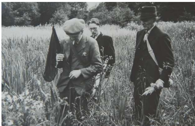
Figure 1. “Strensall Common” taken in 1944 by R.J. Batters, © Richard B. Walker. This view shows three entomologists engaged in daytime field collecting. During the Second World War, blackout regulations restricted night-time collection of Lepidoptera. Reproduced with permission from Richard B. Walker.

The Dark Bordered Beauty moth Epione vespertaria (Lepidoptera, Geometridae) is a Red Data Book species (Shirt, 1987), currently only known from a single English site, Strensall Common, about 10km north of York (Baker, 2012; Baker et al. , 2016). Publications mention Yorkshire as a locality for Dark Bordered Beauty in the 1820s (Stephens, 1829), York itself is mentioned by the 1860s (Walker, 1860) and specific sites around York are mentioned by the 1870s (Anon, 1878). Initially the most mentioned site was Sandburn (e.g. Porritt, 1883), along the Malton Road (A64), but later the adjacent site of Strensall (Figure 1), to the west of Sandburn, became better reported (e.g. Hewett, 1900). The moth was also collected at Askham Bog, to the south west of York in 1893 by S. Walker & R. Dutton, and again in 1898, but this fact was generally unrecognized until recently (Mayhew, 2018).