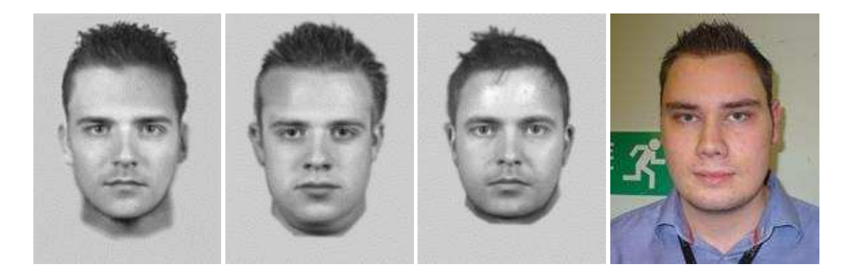
Figure 2. Example composites constructed from a holistic system of one of the targets (far right) used in the experiment. Each composite was produced by a different participant 22-26 hours after having watched a video of the target person giving directions to a local town centre. From left to right, the composite was produced without providing a description of the face (no-description), after freely recalling the face (description no-delay) and 30 minutes after free recall (description delay).