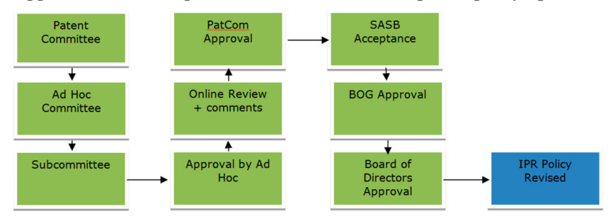
Appendix 1. Scheme procedure of IEEE-SA 2015 patent policy update

No potential conflict of interest was reported by the authors.