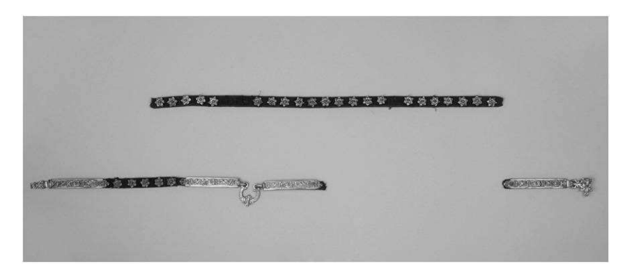
Figure 4. Sword belt (leather, velvet, bronze, gold). Germany, ca. 1600. Wallace Collection, A1067.

decorative. On 18 November 1578, at the beginning of a three-week spending spree, North spent nineteen shillings on the gilding of a sword and on a new scabbard. This gilding—North calls it "indoratura" could indicate one of three common sixteenth-century techniques: either damascening, in which a precious metal was inlaid into iron or steel; the cheaper and more fragile false damascening, whereby gold or silver wire was worked into grooves etched into a metal surface with a sharp tool; or fire gilding, which involved using a heated mixture of gold and mercury to bond a gold coating to iron or steel. Four days later, North spent a further twelve shillings on the gilding or regilding of another sword and dagger set. The ornamentation of these weapons with precious metals suggests that they were largely for display. It was normally only the hilt of a sword that was ornamented in this way: while unsheathing the blade in public could be a dangerous and potentially explosive act, the hilt—like the scabbard and furniture—was constantly on show.