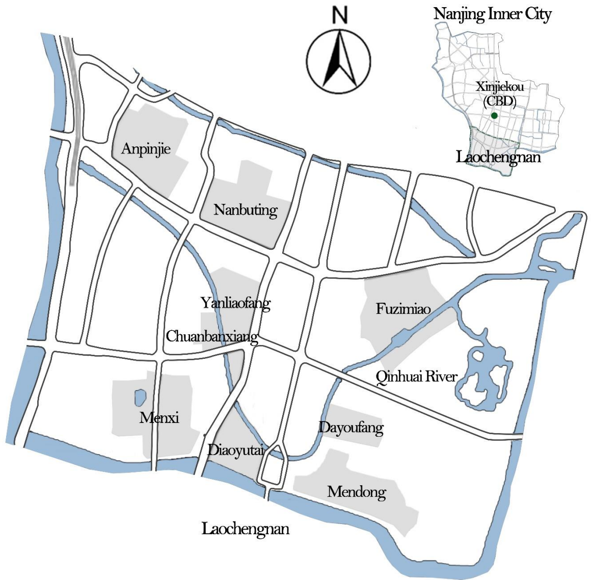
Figure 1. The location and layout of Laochengnan in Nanjing