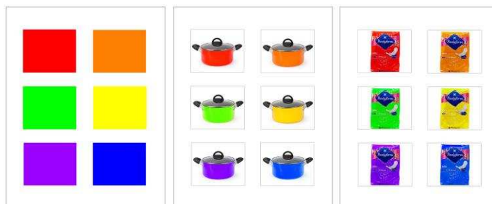
Figure 1: The coloured images for two of the products in each of the six colour options and the six colour patches that were used to determine colour preference.

Two experiments were employed in this study, an online survey and a laboratory experiment. In both experiments participants were showed the six coloured images for each product in turn (the order were presented randomly for each participant), and asked to investigate which colour they would like to choose if asked to select a product to purchase. In the laboratory experiment, participants were additionally asked to indicate, for each product, to what extent they think colour could be related to the products' performance and function. Participants did this by selecting from a 5-point Likert scale (where one extreme was no relationship with functionality/performance and the other extreme was 100% relationship with functionality/performance). At the end of each experiment, participants were asked which colour patches they prefer most.