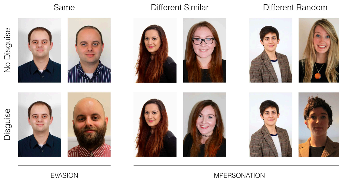
Figure 2. Example image pairs for each condition of the face matching task in Experiment 1. The top row shows No Disguise images of the Same person (left), a Different person of Similar appearance (centre), and a Different person selected at Random (right). The bottom row shows the Disguise conditions, with the disguised image shown on the right of each pair. The Disguise could involve Evasion (in Same person pairs), or Impersonation (in Different person pairs). In Evasion disguise (left column) the disguised model (right image) tries to escape their normal appearance (left image). In Impersonation disguise (centre and right columns) a different model (right image) tries to mimic the normal appearance of the target model (left image).

Experimental stimuli were photo pairs constructed from the FAÇADE images (see Figure 2). The matching task used a 2 x 3 within-subjects design, with the factors Disguise Condition ( Disguise and No Disguise ) and Pair Type ( Same , Different Similar , and Different Random ). Each of the 26 models appeared in each of the six conditions, resulting in 156 trials in total. The dependent variable was percentage accuracy in the face-matching task for each of these conditions.