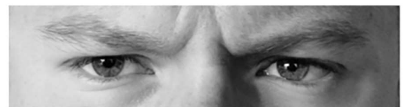
Fig 1. Photographs of signs 2 and 3, illustrating the two types of wording used and images of eyes and pawprints used respectively as the treatment and control. The signs had a brown wood-effect background with yellow borders and text. The eyes and pawprints were greyscale.

https://doi.org/10.1371/journal.pone.0207246.g001