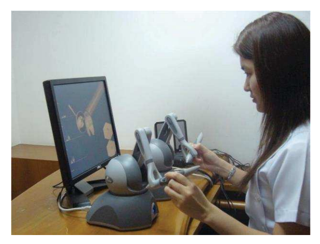
Figure 2 - A student using a Haptic Desktop (From 42 Reproduced with permission)