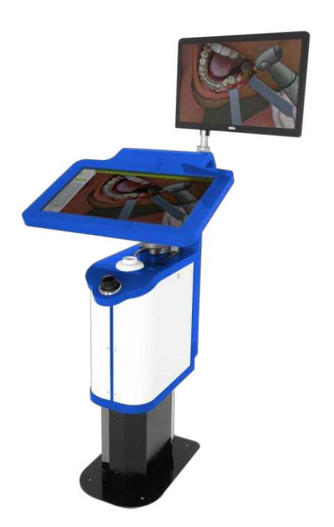
Figure 4 – A Dental Skills Trainer, the VirTeaSy Dental, HRV, Laval, France

one step further by providing a bespoke enclosure for the hardware. This enclosure adds dental specific features to facilitate a better operating position, such as a finger rest stage and height adjustment controls, recreating some of the environmental 'physicality' that is present in flight simulators.