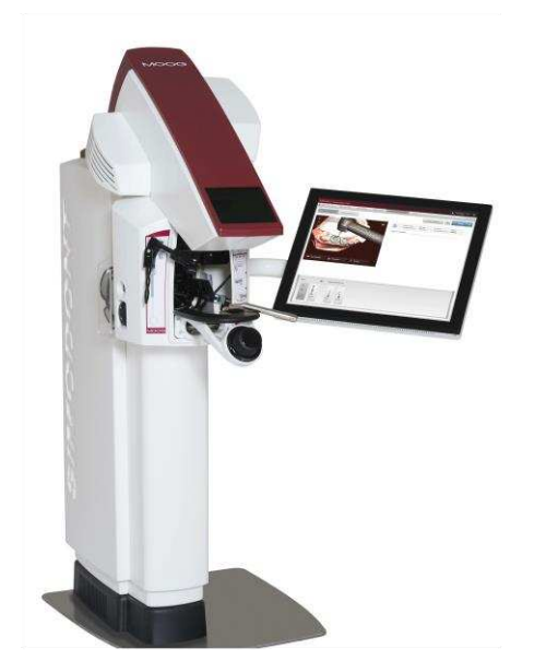
Figure 5 - A Dental Skills Trainer, the SIMODONT ®, MOOG, USA