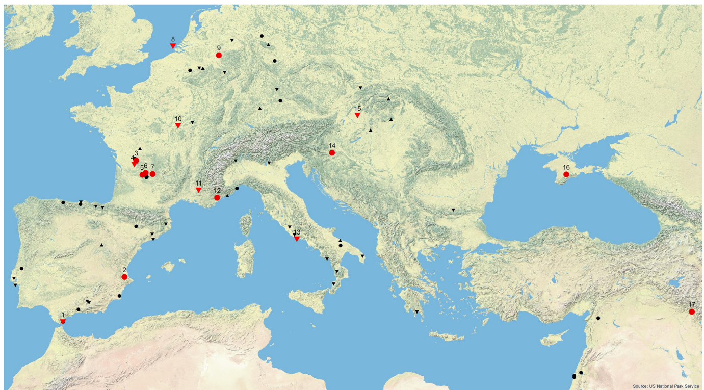
Fig. 1. Sites with Neanderthal skeletal material and key sites with probable evidence of recovery through care. Healthcare case studies (see Table 1) are in red and numbered: 1) Forbes' Quarry, 2) Cova Negra, 3) Les Pradelles, 4) La Quina, 5) La Ferrassie, 6) Regourdou, 7) La Chapelle-aux-Saints, 8) Zeeland Ridges, 9) Kleine Feldhofer, 10) Arcy-sur-Cure, 11) Bau de l'Aubésier, 12) Saint Césaire, 13) Riparo Mezzena, 14) Guattari, 15) Krapina, 16) Šala, 17) Kiik-Koba, 18) Shanidar. Neanderthal skeletal material (black) is compiled from Nespos and (Diedrich, 2014) with additions). Symbols: ▼ cranial/dental material only ▲ postcranial material only ● near complete or partial skeleton.

diseases) are identified in skeletal material for example, and of these only the most severe cases can be attributed to probable care from others with any confidence. Equally many injuries or illnesses which are life threatening without moderate care leave no palaeopathological signature in skeletal material. These could include healthcare that allows rest by provisions of food, water or warmth or by prevention of deteriorations (e.g. wound cleaning). Costly cases of care are highly visible archaeologically whilst more common care for moderate injuries and illness are largely invisible. The visible archaeological evidence for care is best understood as the 'tip of the iceberg' of practices of healthcare which would have been