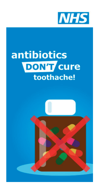
Figure 2. UK Dental Antimicrobial Stewardship Leaflet Cover (16).

If left untreated, a dental infection may ultimately progress to become severe sepsis. Timely draining and removing the source of a dental infection through extraction of the tooth or removing any decay and clearing the pulp chamber/root canal is generally indicated. Whether an antibiotic is also indicated depends on whether the infection has become systemic (3–5). Full details on how to make that assessment are included in the FGDP guidance. An important element of the decision-making