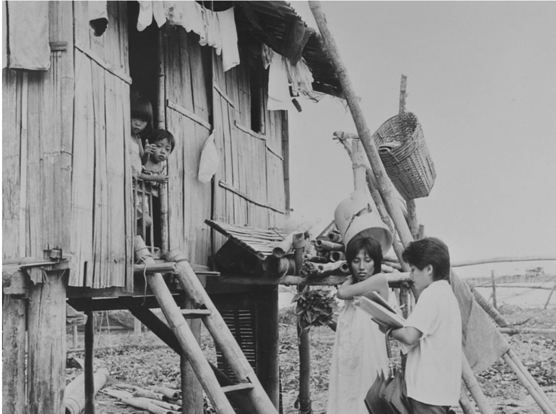
Figure 2: ‘A community health worker on her house rounds’ (1980)

tradition of engaging and persuading audiences by using ideologies of rescue, care and compassion developed for western audiences in the aftermath of the Second World War. 63