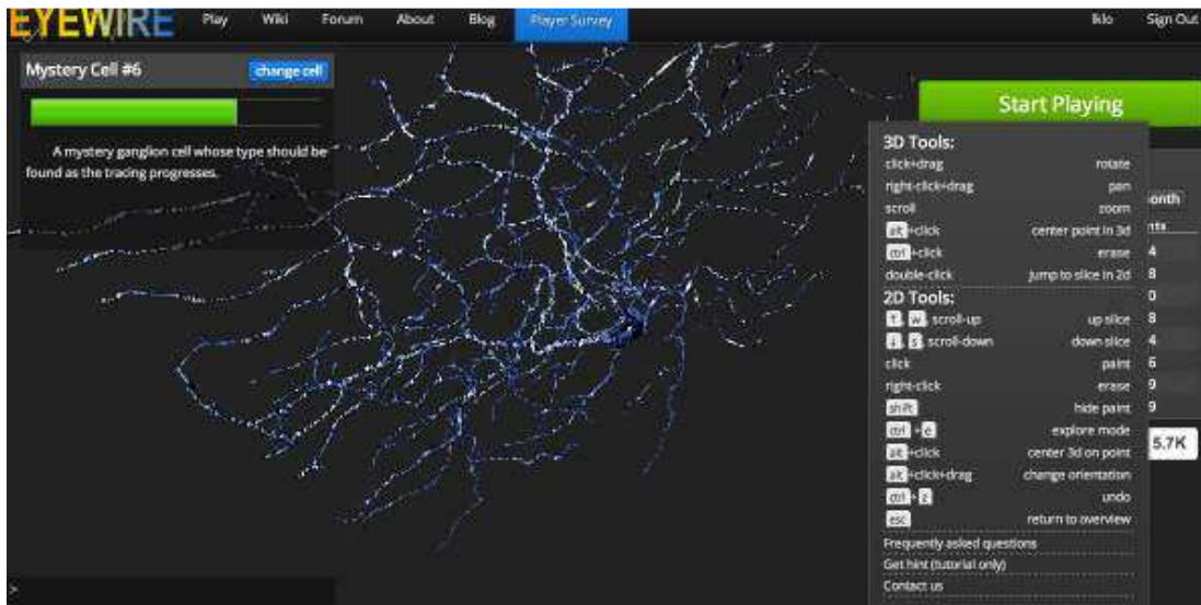
Figure 12: help summary for 3D and 2D controls in Eyewire