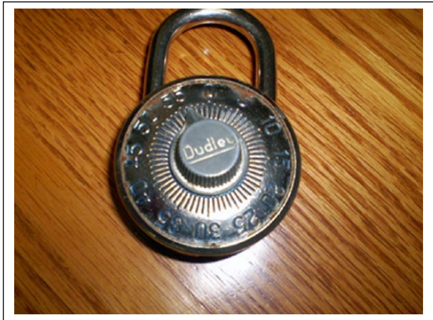
Figure 2. Locked.

The interiority of suicidality also led to pressures to remedy the issue(s) from within. Talking about Figure 2, Raj detailed the challenges of finding the right combination of strategies to avoid suicide.