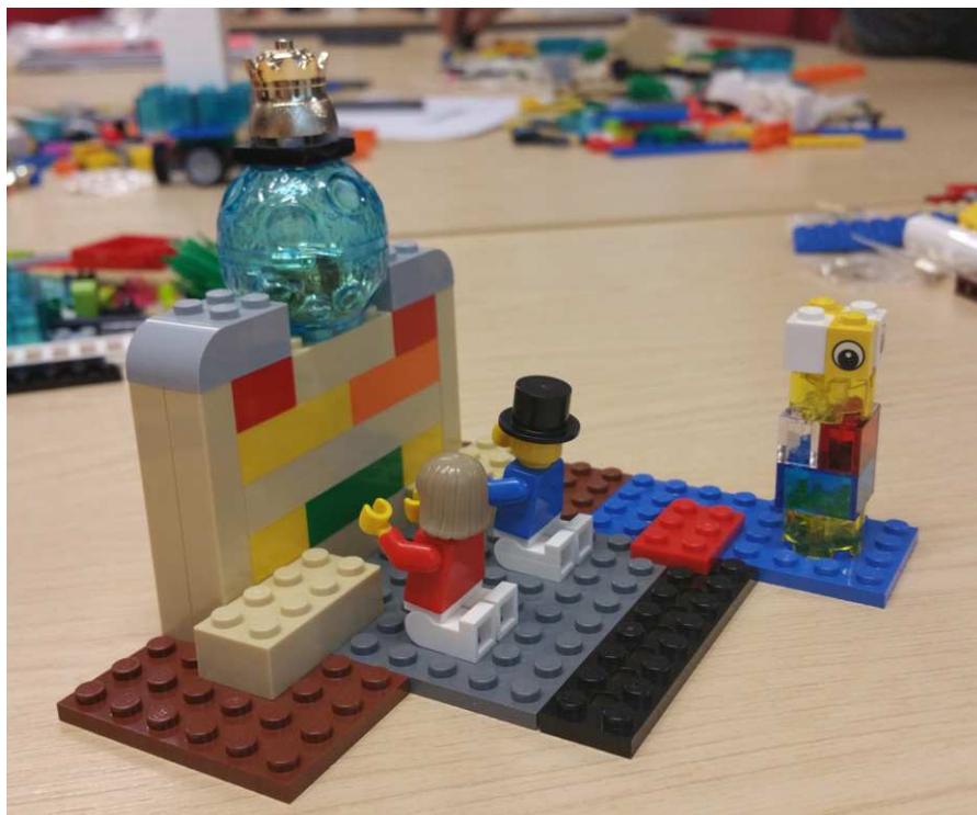
Figure 2. Economic incentives.

“[P]eople [are] always looking forward and looking up to what is the financial ideal, what is the market, or what can we patent, what can we get money for? Whereas the strange animal that is academic and socially valuable research is left in the corner”.