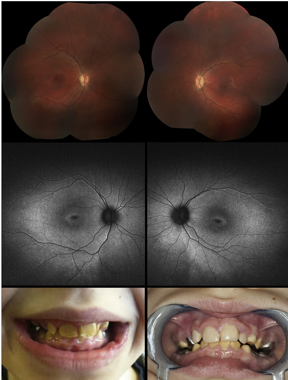
FIGURE 2. Images demonstrating the phenotype of Patient 5. Fundus appearances at presentation showing tilted optic discs, loss of the foveal light reflex, and mild vascular attenuation in the right eye (Top left) and left eye (Top right). Fundus autofluorescence imaging 3 years later showed generalized hyperautofluorescence in the posterior pole as well as a ring of hyperautofluorescence around the fovea in both the right (Middle left) and left (Middle right) eyes. (Bottom left) Teeth at presentation, demonstrating enamel hypoplasia and the presence of crowns. (Bottom right) Teeth 3 years later, after upper teeth had been resurfaced.

to the DA6.0 response. Cone-driven responses (both LA6.0 and 30 Hz flicker) were severely reduced in each eye.