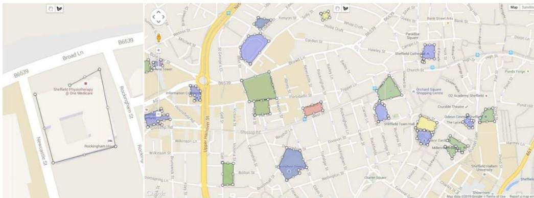
Figure 3: Creating Geofences (left) using mouse gestures to define boundaries. Colour-coded geofences for different related tasks (right): red indicating danger, green indicating points of interest, blue indicating areas with analog sensors.

techniques to expand to new regions as and when a demand for information is established. This provides authorities with a better understanding of new regions, supported by a collaborative partnership with citizens. Citizens can contribute significantly by acting as the 'eyes and ears on the ground'. They can directly inform authorities of the analog sensor values, send an image or video, or stream audio/video to control units etc. We describe our approach (Mazumdar et al., 2014) from two perspectives: