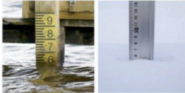
Figure 2: Examples of analog gauge boards