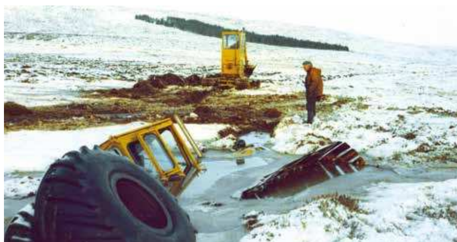
Figure 2: The difficulties of peatland afforestation. In this 1983 image a tractor and plough (the same vehicle as Figure 1) has become bogged down in deep peat at Benmore in Shin Forest, Sutherland.

For more than a century, Scottish peatland has attracted the interest of foresters as a potential location for new forestry. To quote an early twentieth century forester: “There is a special fascination in coaxing useful plantations to arise ‘in the wide desert where no life is found’” (MacDonald, 1945). While attempts to afforest Scottish peatlands go back to the 18th century, they were limited in extent and success before the mid-20th century. Following the Second World War, the introduction of new tree species, advent of better tractors and the Cuthbertson double mouldboard plough led to the first large-scale plantations by the Forestry Commission (MacDonald, 1957) ( Figure 1 ). While afforesting peatland remained a considerable challenge ( Figure 2 ), it was increasingly technically feasible to plant trees on peat. Later but equally important in promoting peatland forestry was a generous tax incentive system which made afforestation financially very profitable for private companies and individuals (Stroud et al , 2015; Warren, 2000). At a governmental level,