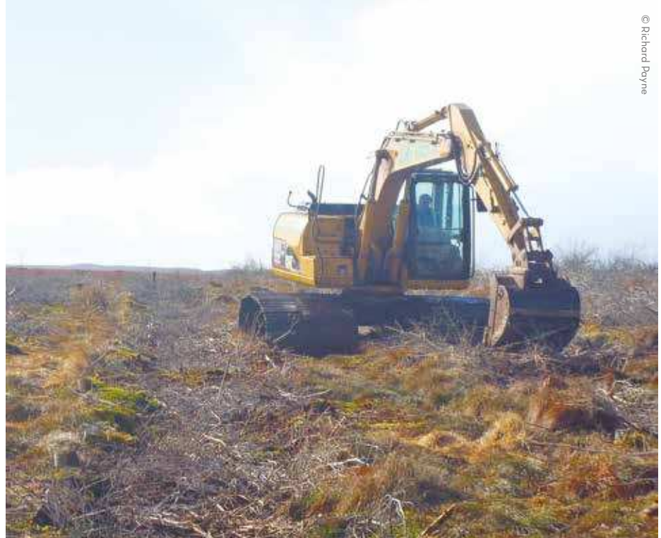
Figure 4: Forest-to-bog peatland restoration underway at RSPB Forsinard. In this 2014 image the digger is conducting secondary treatment, compacting previously felled-to-waste trees into the plough furrows.

Restoration is a long-term process and even sites restored many decades ago remain considerably different from natural peatlands. For most sites the assumption is that once trees are removed and water table raised the plant community will eventually progress towards a community typical of open bog and as this happens other species will also return. However, recovery may be slowed by forestry legacy, such as the release of nutrients from brash and needle litter years after the trees have been removed (Gaffney, 2017). In some sites, certain non-target species can become dominant during restoration (e.g. Molinia caerulea ) and may inhibit the recovery of many typical bog species. In some restoration projects, experiments have been made to speed vegetation recovery through translocation of plants and application of micropropagated plant products in an effort to restore cover of typical species, particularly Sphagnum mosses (Rosenburgh, 2015). Restoration is an ongoing process and practice has developed through a process of trial and error. As complete forest-to-bog restoration is expected to take many decades, the trajectories of restored sites are uncertain. Experience thus far suggests that restoration cannot always be viewed as a ‘one off’ intervention,