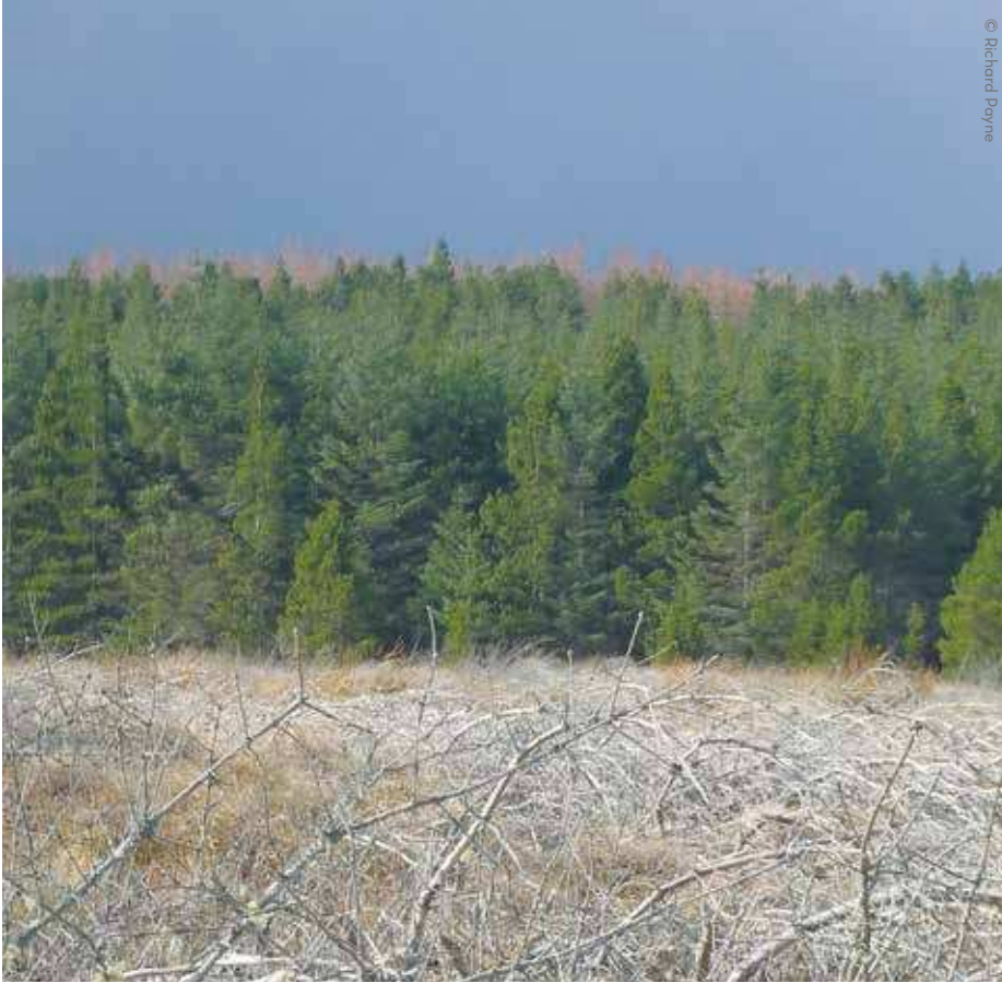
Figure 3: The current state of peatland forestry (RSPB Forsinard in 2014). In the foreground trees have been felled-to-waste as part of peatland restoration while in the background the plantation remains standing.

species are often low, many are species specially adapted to wet and acidic conditions and therefore only found in this habitat. Planting trees on peat leads to a fundamental change in the ecosystem. The tree canopy shades out other plants and drying of the peat surface and nutrient addition change the very characteristics of the ecosystem which peatland organisms are adapted to. Consequently, the plant and animal communities found in afforested peatland are very different to those of natural, open, peatland (Stroud et al. , 1988). Planted sites typically include a greater abundance of generalist and woodland species and far fewer peatland specialists. This is most immediately apparent in the plants: open peatlands typically have extensive carpets of Sphagnum mosses, sedges and shrubs; whereas afforested peatlands typically have large areas of needle-covered bare peat, brown mosses and Sphagnum is often entirely restricted to wet ditches (Stroud et al. , 1988). The loss of Sphagnum with afforestation is particularly significant as these mosses are often considered to be ‘ecosystem engineers’, due to their roles in acidifying and slowing decomposition in peatlands (van Breemen, 1995). The effects of peatland afforestation on biodiversity may extend well beyond the plantation itself through the effects of forestry on surrounding unplanted peatland and the influence of trees and