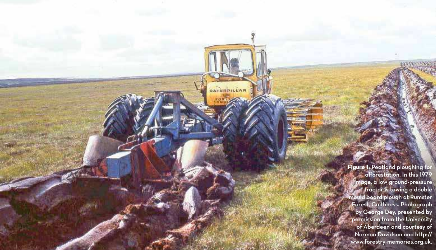
Figure 1: Peatland ploughing for afforestation. In this 1979 image, a low ground-pressure tractor is towing a double mould board plough at Rumster Forest, Caithness.

to 30% of the total land area (Chapman et al , 2009), a higher proportion than almost any country in Europe (Montanarella et al , 2006). The largest extents of peat occur in the north and west, particularly the Flow Country of Caithness and Sutherland, the Isle of Lewis, and Dumfries and Galloway (Chapman et al , 2009). This peatland has traditionally been viewed by some as low-value wasteland, often used only for deer stalking, or low-density sheep grazing.