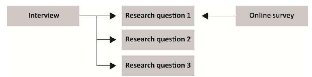
Figure 1: Data collection methods to answer research questions 1–3

As a primary data collection method, face-to-face interviews were designed to mainly answer research questions 1–3. An online survey was designed to supplement the findings from the interviews for the first research question (Figure 1).