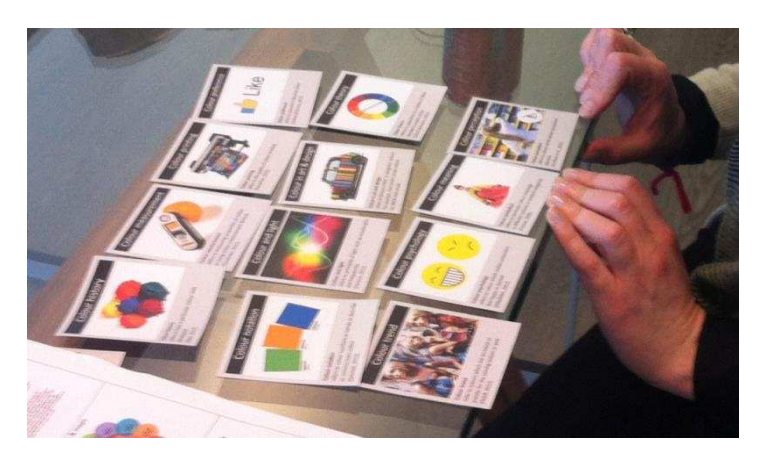
Figure 2: Example of cards sorted by a participant

Semi-structured interviews were selected and all participants were asked 25 identical, openended questions. The predetermined set of questions included five criteria: participants' profile, colour decision, types of important colour information and why these types are important, current use of colour information, and preferences and suggestions. However, the interviewer asked additional questions to clarify and further expand certain issues. A card-sorting task was also employed to evaluate the importance of the different types of colour information (Figure 2).