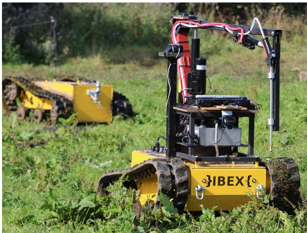
Fig. 1 Example of an autonomous small robot for agriculture (agribot). This agribot weighs 250 kg and precision spray weeds on hill farms.

In contrast, small autonomous robots for agriculture (“agribots”, Fig. 1) have focused on precision applications. Large vehicles are required for bulk operations due to the need for physically transporting bulk materials such as seeds, fertiliser and produce. Small robots make up for reduced bulk transport capability by aiming, ultimately, to work on a per-plant basis. This enables them to transport smaller amounts of more targeted materials, including reduced herbicide doses to apply to individual weeds (Binch and Fox 2017), detect the fertiliser needs of and apply fertilisers to (Singh and Shaligram 2014) individual plants; and harvesting of plants (Bac et al. 2014) when they are individually optimally ready for consumption.