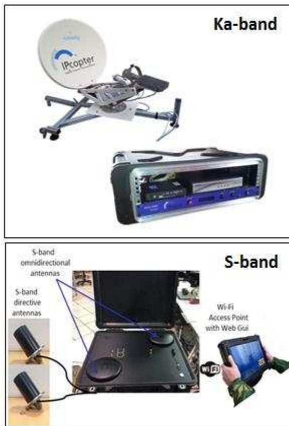
Figure 5. Ka-band Backhauling (Antenna and Suitcase Unit) and S-band Messaging (Modem, Wi-Fi and Antennas) Satellite Equipment.

The Ka-band backhauling makes use of the Tooway system of Eutelsat, that provides satellite broadband services over all Europe via the 82 spots of the high-throughput geostationary satellite KA-SAT, positioned at 9° East. The ground segment is composed of 8 terrestrial gateways, plus 2 for back-up, deployed in different regions and inter-connected in a fiber ring for maximum reliability. This backhauling solution provides a tried and tested, stable, and reliable platform able to perform any IP communication, from voice to data, from any location in Europe as long as there is line of sight from the terminal to the satellite.