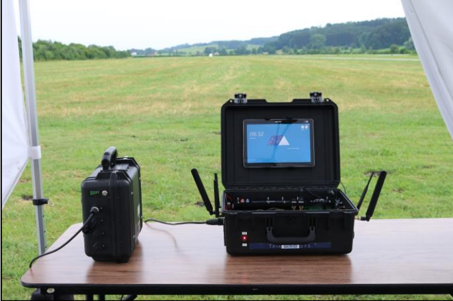
Figure 4. Portable land mobile unit equipment (PLMU, on the right) and its battery (on the left) during validation phase.

The PLMU corresponds to the terrestrial communication segment of the ABSOLUTE architecture. This unit is deployed on the ground and therefore offers a smaller coverage compared to that reached with the AeNB. However, it provides additional wireless communication technologies and it is also highly modular for answering different users' needs. The PLMU has been implemented as a complete communication system embedded into a rugged suitcase as shown in Figure 4. It is composed of several components as listed in Table 1. The entire system can be powered either by a regular power outlet or by a battery pack providing up to several days of autonomy, depending on the battery capacity and the components being in use. The PLMU is modular and easily adaptable to the requirements of each specific emergency situation by using only the required communication technologies, which are switching on/off using the relay blocks module. External devices can be plugged to the PLMU for extending its capabilities, e.g. a satellite system for enabling satellite backhauling.