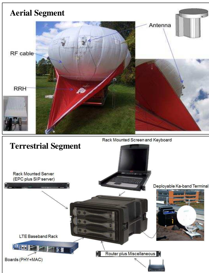
Figure 3. Aerial-eNodeB implementation: aerial segment (RRH and antenna) and terrestrial segment (EPC, LTE base band Ka-band equipment) pictures during validation phase.

An important component of the aerial segment is the Helikite, which is a helium inflatable kite that relies on lighter-than-air principles to achieve buoyancy, with increased lift and stability thanks to its kite profile and the use of a tether (which is moored to the terrestrial segment). Helikites aerostats are reliable in high winds, heavy rainfall or very dusty conditions. The ABSOLUTE system use moderate sized helikites of 34\text{m}^3 , highly mobile, simple/fast to set up, and only require a few days training for the operators. This helikite is 6.5 meters long, 5 meters wide, and has a net helium lift in no wind, in dry conditions, of 14 kilograms. Note that rainfall, snow, sleet etc. will reduce the lift by 3 kilograms or so. Therefore, this leaves about 10kg for maximum payload, including RRH, fiber-optic, batteries, waterproof cases, etc.