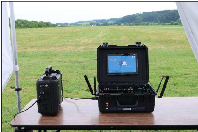
Figure 4. Portable land mobile unit equipment (PLMU, on the right) and its battery (on the left) during validation phase.

The PLMU corresponds to the terrestrial communication segment of the ABSOLUTE architecture. This unit is deployed on the ground and therefore offers a smaller coverage compared to that reached with the AeNB. However, it provides additional wireless communication technologies and it is also highly modular for answering different users' needs. The PLMU has been implemented as a complete communication system embedded into a rugged suitcase as shown in Figure 4. It is composed of several components as listed in Table 1. The entire system can be powered either by a regular power outlet or by a battery pack providing up to several days of autonomy, depending on the battery capacity and the components being in use. The PLMU is modular and easily adaptable to the requirements of each specific emergency situation by using only the required communication technologies, which are switching on/off using the relay blocks module. External devices can be plugged to the PLMU for extending its capabilities, e.g. a satellite system for enabling satellite backhauling.