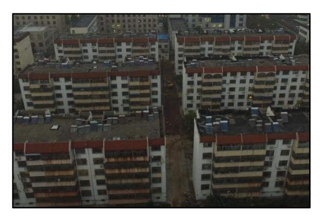
Fig. 5. Individually installed SWHs on the roof of residential buildings in Rizhao.

In 2004, seeking a solution for unregulated installation of SWHs, a government official in the Bureau of Housing and Urban-Rural Development of Ju County went to Himin's production base in Dezhou city, where he saw for the first time the building-integrated SWH installed in dormitory buildings (D11 -> D23). Inspired by Himin's own self-regulation, this official issued a proposal for integrating SWHs into the design and construction of residential buildings in Ju county, which was later documented in their regular conference summary as "the mandatory installation regulation of building-integrated SWH in newly-built residential buildings" (D23) (Interview, Real estate developer). Although an official regulation was not issued in Ju county, the mandatory installation of SWH was implemented quite strictly (Interview, Government), which helped the maintenance of SWH related socio-technical experimentation in Rizhao in terms of market expansion and legitimacy building (D23 -> D14 and D16).