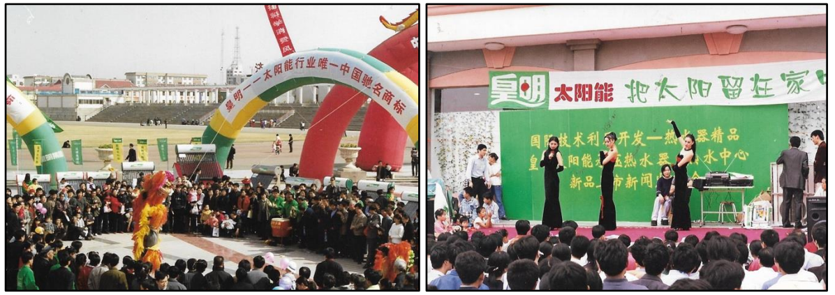
Fig. 3. Advertising activities organized by Himin in the 1990s.