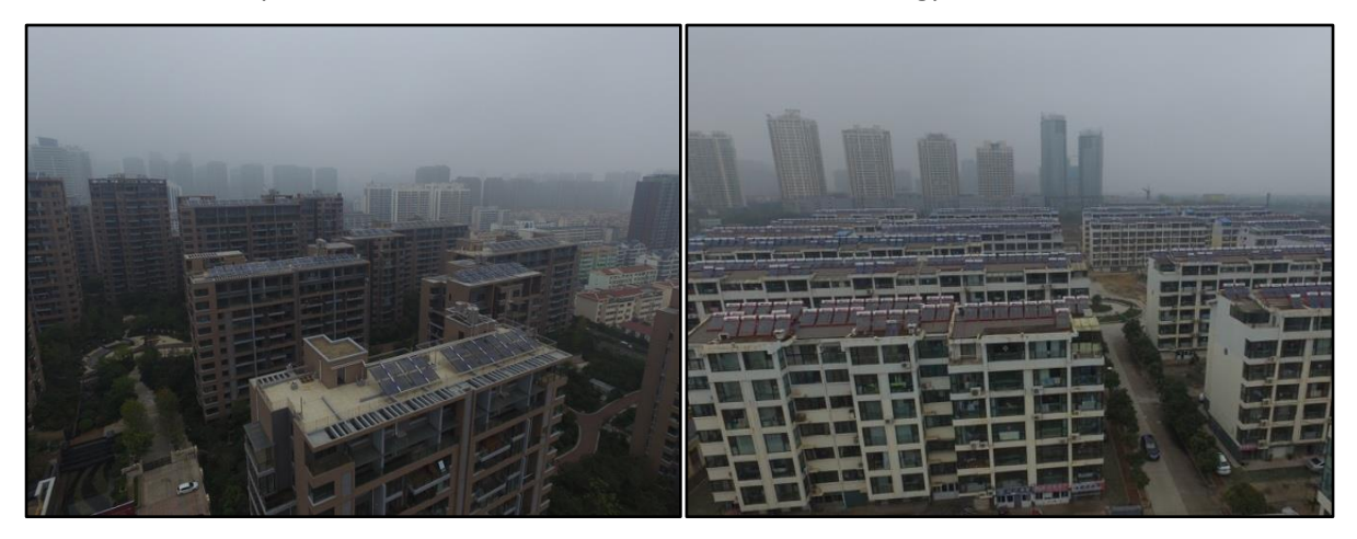
Fig. 6. The embeddedness of SWH in the urban landscape in Rizhao.

In the case of Rizhao, socio-spatial reconfigurations mainly manifest in the formation of industry clusters and the changes in urban infrastructures, consumption culture and social practices. In 2011, there were more than 150 SWH-related enterprises in Rizhao, providing more than 30,000 jobs<sup>13</sup>. In particular, in Ju county, many small SWH-related enterprises cluster around the production base of Muyang (D32). The urban built environment is reconfigured around SWH popularization. Fig. 6 illustrates the embeddedness of SWH in the urban landscape in Rizhao (D33). Residents' daily practices are also reshaped around new energy technologies. For instance, the interviews revealed that in relatively under-developed areas in Rizhao, the possession of a SWH is regarded as a symbol of social status, and it is even listed as one of the "must-have items" for a marriage, just as color TV and washing machines<sup>14</sup> (D33) (Interview, End-user). This is a typical case of the reconfiguration process of residents' consumption culture and the embeddedness of solar energy into the local contexts.