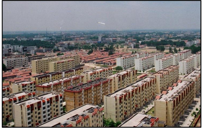
Fig. 4. A bird's eye view of the roof-mounted SWHs in Ju county, Rizhao.

In Rizhao, a promising market attracted new enterprises into the industry. Muyang, a local SWH manufacturer in Ju county in Rizhao, was founded in 2003 (D11). Following the experience of