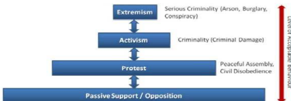
Figure 1 – The Structure of Protest, taken from ACPO (2015) Policing linked to Onshore Oil and Gas Operations, London: National Police Chief’s Council, 8.

The diagram and explanation are included as part of a discussion about the benefits of establishing good relationships with protesters and local supporters at anti-fracking protests, in line with the commitment to dialogue. The breakdown of the structure of protest here though defines protest in terms of accepted tactics in distinction to activism defined by criminality. Here the divide between these groups mirrors the distinction drawn between ‘contained’ and transgressive protest that Gillham (2011) argues has been central to targeted protest policing in the US in recent years. Indeed, the Network for Police Monitoring [Netpol] have pointed out, ‘the guidance proposes that these categorisations will be used to ‘tailor’ police responses’ (2015a: 9).