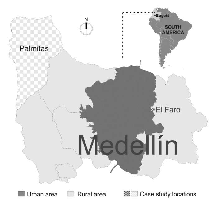
Fig. 2. Map of El Faro and Palmitas (Medellín, Colombia, South America).

Participants were recruited through local NGOs, which have regular presence in, and are trusted by, the communities. The NGO "Techo" is