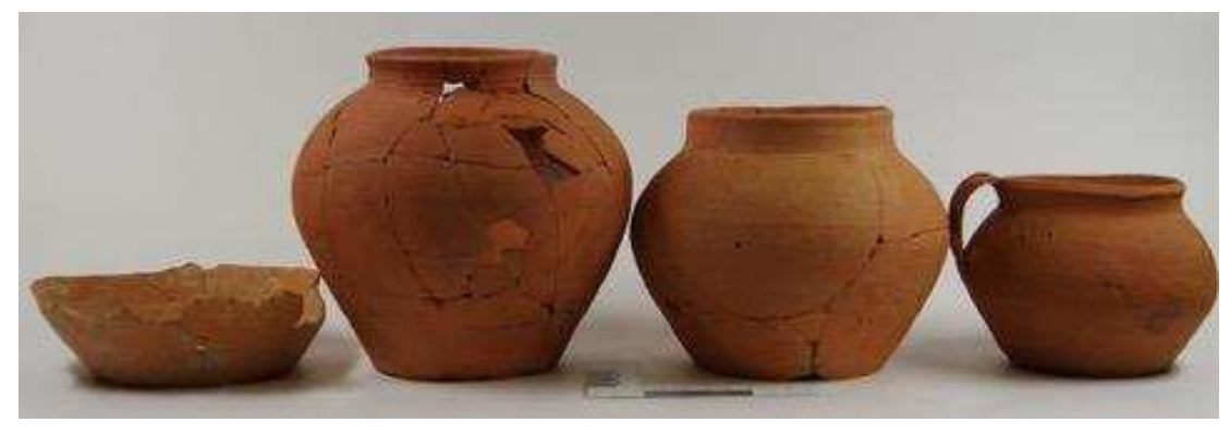
Figure 4. Ceramic pots found in building deposits from Zaballa, Salvatierra, Vitoria, Mavilla (from left to right).