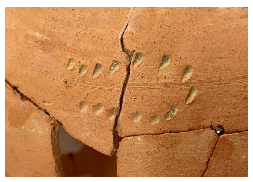
Figure 2. Incision mark found in one of the pots of Torrentejo, Labastida, 12th century AD.