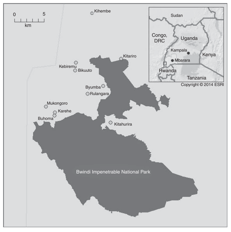
Fig. 1 Map of Batwa communities in Kanungu District, Uganda

with parallel sites in the Peruvian Amazon (Shawi, Shipibo) and the Canadian Arctic (Inuit).