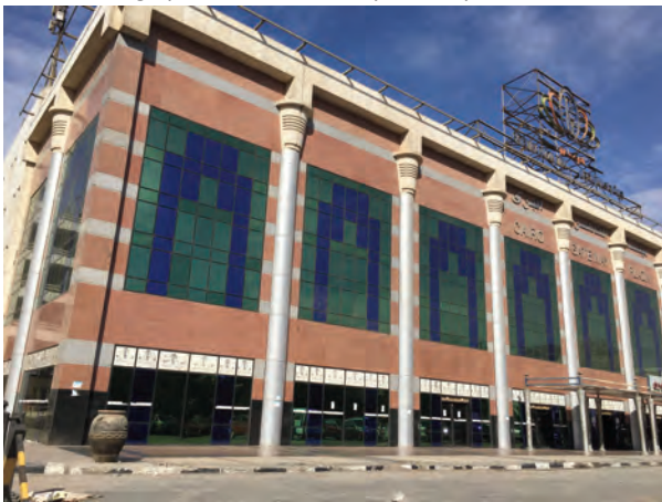
Figure 1. Cairo's International Bus Terminal constructed on the site of Ishash al-Tourguman slums in Bulaq in 2001 (Source: Author).

The paper discusses how wounded spaces, marked by past deficits of power, violence, and exclusion in Cairo, are represented and how the spatiality of places remarkably articulates scars that are never cured by time but are still remembered and lived. Do relocation practices require care and attention that limit the violence and difficulty of abandoning a place? My argument is that such wounded spaces in Egypt insinuate the capacity that places should not remain the same physically and socially because they have been profoundly threatening postcolonial imperial processes. This