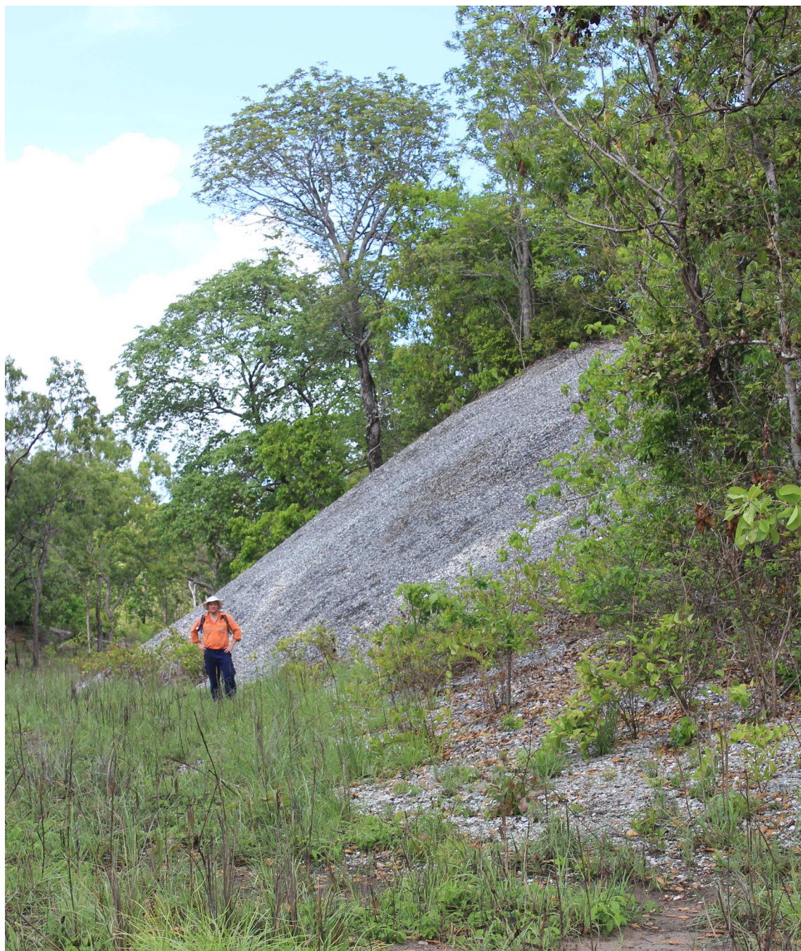
Fig 2. Large shell mound in the vicinity of the study area. Predominantly composed of the shells of the bivalve Tegillarca granosa (syn. Anadara granosa (Linnaeus 1758)), some mounds attain heights of ten metres or more. (The individual pictured gave written informed consent (as outlined in PLOS consent form) to publish his image).

https://doi.org/10.1371/journal.pone.0183863.g002