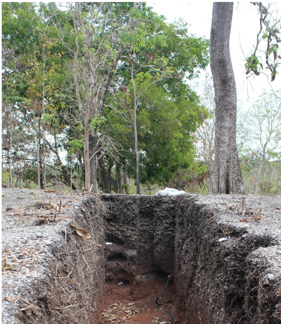
Fig 4. Trench dug by hand into WPSM55. The end face of the trench is located at the thickest part of the shell mound. Samples for radiocarbon dating, shell measurements, and Optically Stimulated Luminescence dating of the mound substrate have been collected.

https://doi.org/10.1371/journal.pone.0183863.g004