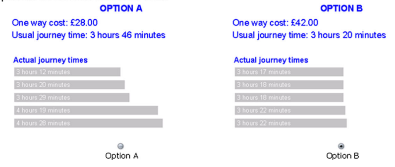
Fig. 2 Time versus cost versus reliability experiment (SP2) for car

Imagine that on five occasions that you make the car journey departing at the same time and on the same day of the week , the actual travel time varies for the reasons suggested previously. We want you to think about that car journey and look at the two options below, each of which show five possible travel times that could arise.