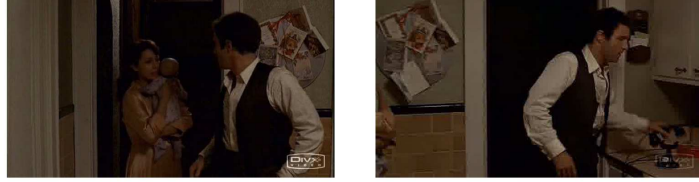
Shot-based descriptions: (a) A man is standing to the right of a woman in a living room. (b) She is walking toward him in a living room. (c) A man is walking toward a phone in a living room. (d) He is answering the phone in a living room. Post-processed description: In this video, a man is standing to the right of a woman, while she is walking toward him in a living room. Next, a man is walking toward a phone. Later, he is answering the phone.