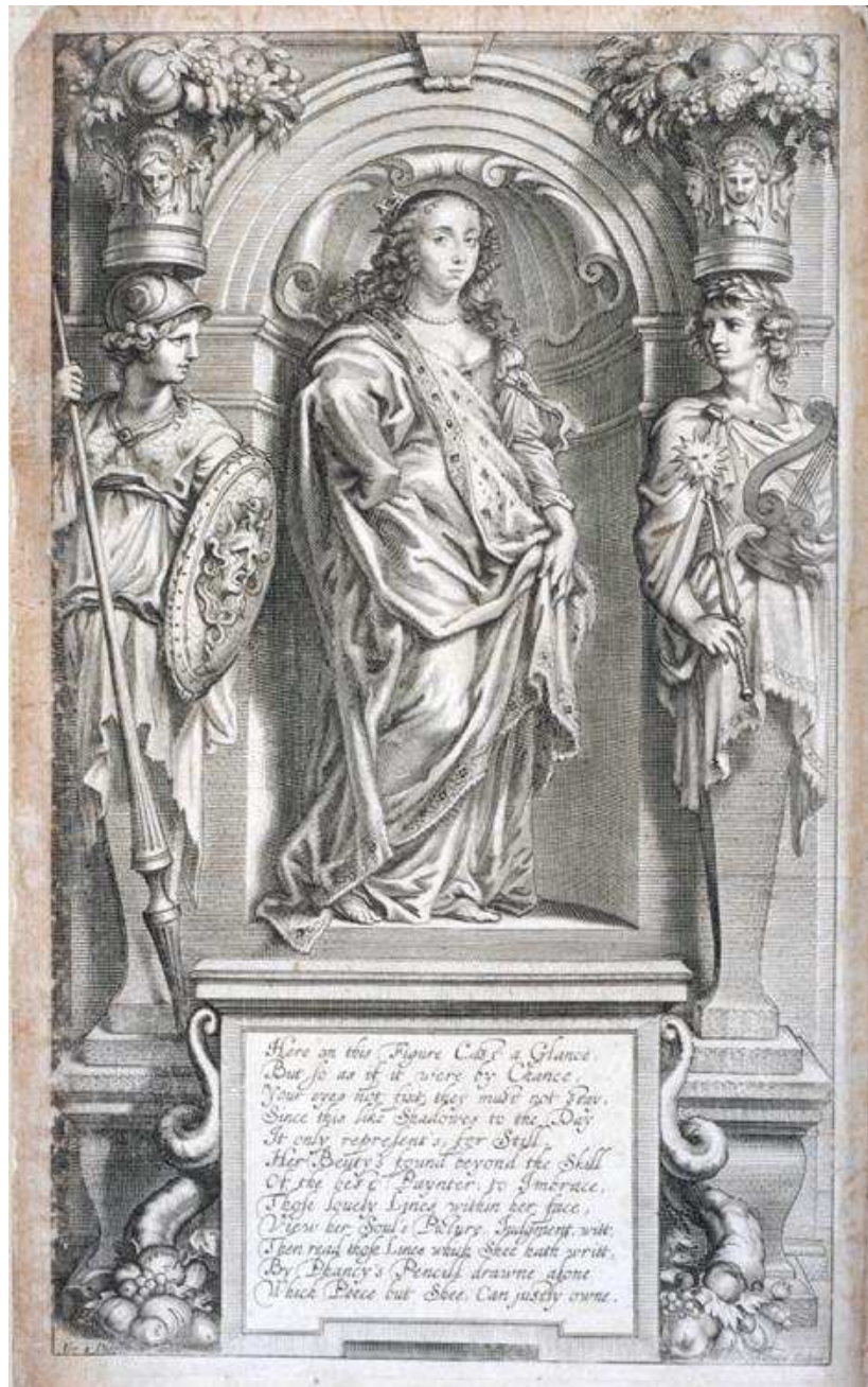
Figure three: Margaret Cavendish, Frontispiece from Grounds of natural philosophy (1668)

[21] However, Cavendish's opposition to microscopy was more thoroughgoing (and more interesting) than merely exposing its ineptitude in what it claimed and aimed to do. When she writes of exterior knowledge and interior knowledge, she does not mean what we can know from the outside and what we might like to know about the inside. Rather, she means what the exterior of an object knows and the different knowledge of the interior. Cavendish's world is vitalist; its matter is alive, aware and perceptive, even while that world is quite some distance, tonally and philosophically, from any kind of mysticism we might associate with vitalist thought. It is not infused with the divine, and if formally it constitutes panpsychism, it nevertheless has little sense of an anima mundi or a world electric with god. This makes for a curious reading experience that is the converse of the microscopists. Where Power, Hooke and Charleton produce baroque and elegiac prose, awe-struck empiricism at the intricacy of the universe, whose wonder borders on psalm-like prayer,