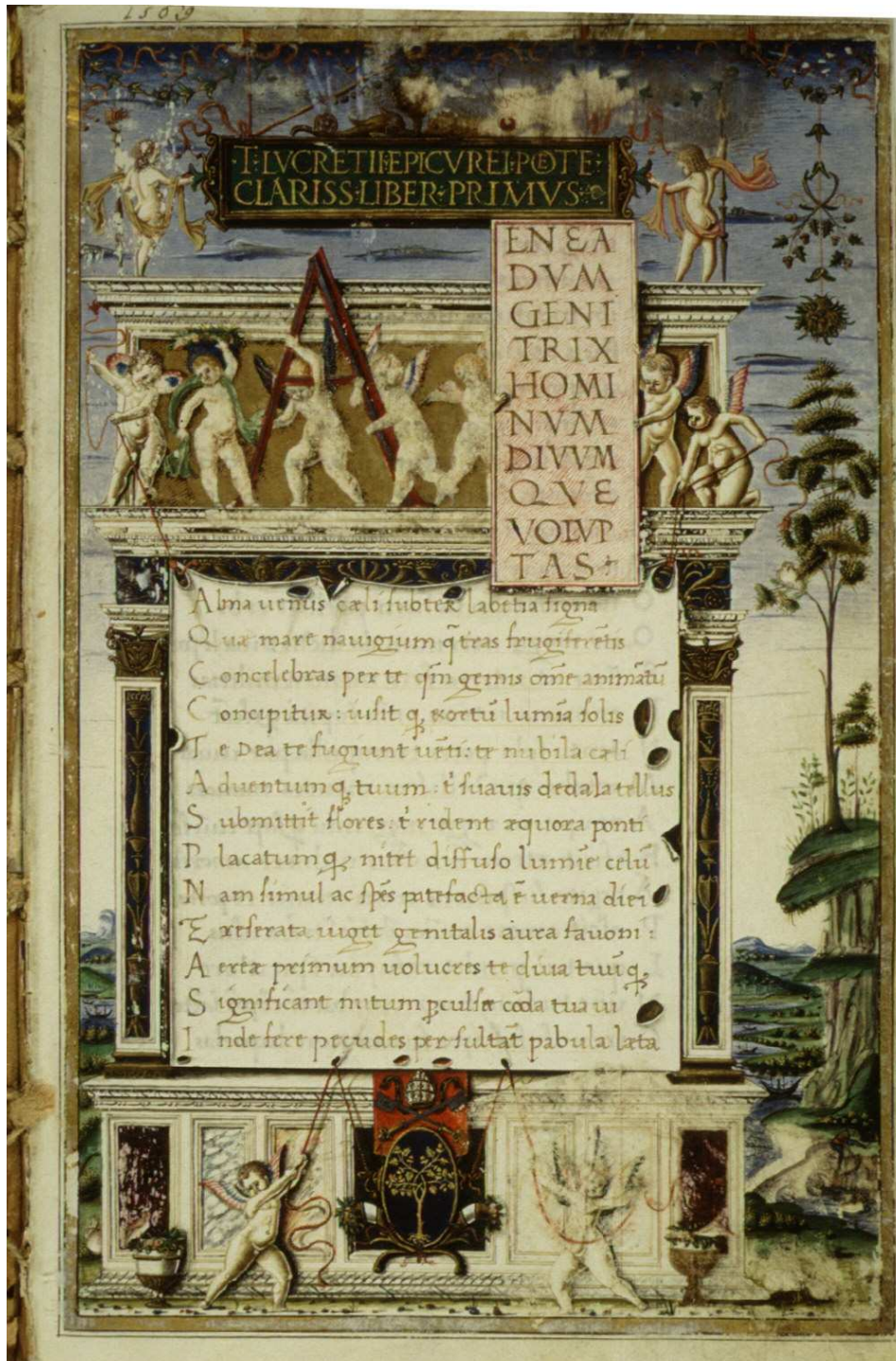
Figure two: Lucretius, De rerum natura , Vat. lat. 1569 fol. 1 recto medbio04 NAN.13