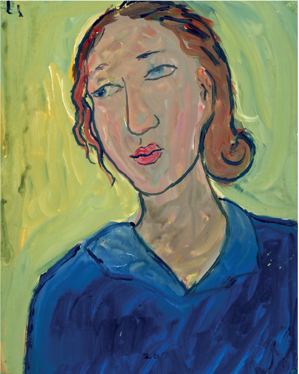
Fig. 5. CS [Charlotte Salomon], Jealous Charlotte (main part painting, no. 261, JHM 4639), Leben? oder Theater? , 1941–42, gouache on paper, 25 x 32.5 cm. Jewish Historical Museum/Charlotte Salomon Foundation, Amsterdam. The overlay says: “Charlotte is not sure of her emotions. Is it jealousy or something else growing within her where her love is concerned?”