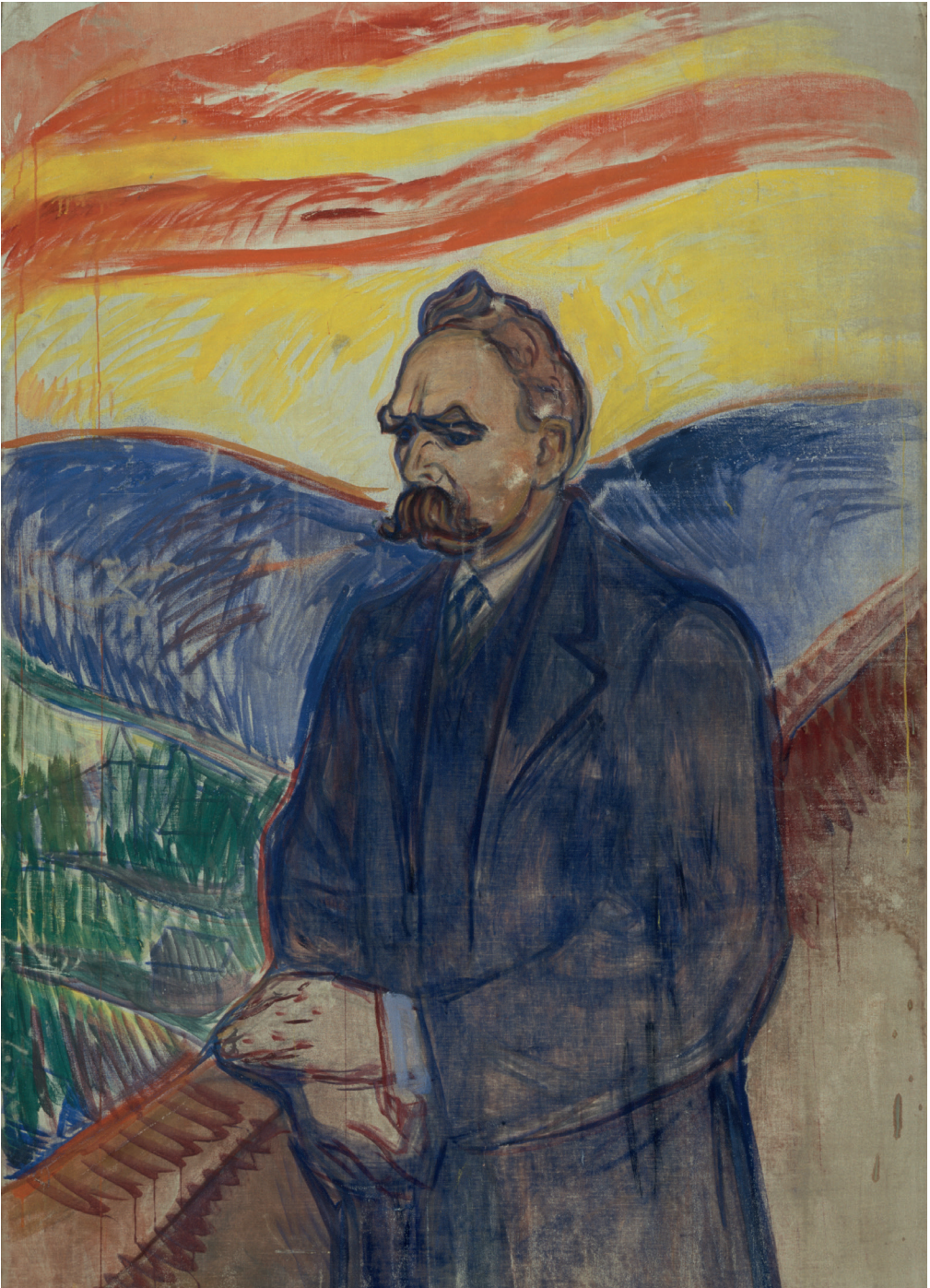
Fig. 7. Edvard Munch, Portrait of German Philosopher Friedrich Nietzsche , 1906, oil on canvas, 201 x 160 cm. Munch Museum, Oslo.