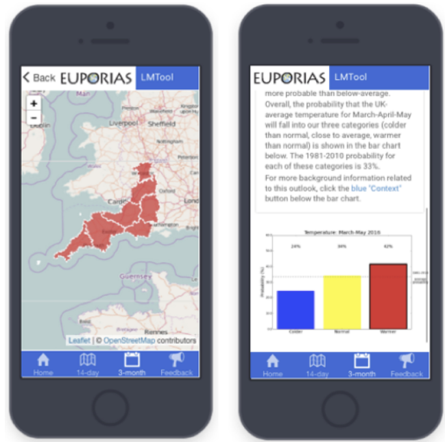
Figure 3. Seasonal climate forecast for temperature for March–May 2016 provided to the farmers through the App.

There are a number of methods and metrics that can be used to help us understand the usability and value of SCF in decision-making (Bruno Soares et al., 2017; Clements et al., 2013). A qualitative approach (i.e. a workshop and in-depth interviews) was adopted to assess the use and value of these forecasts in the farmers' decisions during the winter months of 2015/2016. Given the novelty of applying SCF in Europe and their probabilistic nature allied to the complexity