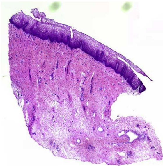
Fig. 2. Representative cervical tissue H&E staining of freeze-thawed cervical tissue. Composite representation of sequential images of an H&E stained section of cervical tissue that had been frozen, cryopreserved, thawed then cultured to d1.

Cervical tissue freezing and viable recovery has seldom been described in detail though Gupta et al., briefly communicated a method during their development of a cervical tissue-derived organ culture model [4]. Gupta and colleagues, using haematoxylin and eosin staining, showed that fresh as well as frozen-thawed cervical tissue maintained its integrity. In addition, they showed that there were no significant differences in the expression levels of cytokeratin and Ki67, two non-immune cellular markers, using immunohistochemistry. Furthermore, they demonstrated that both fresh and freeze-thawed tissue supported HIV-1 transmission and were equally useful for testing antiretroviral compounds. Our studies of tissue viability complement these findings and add important additional evidence, in addition to more comprehensive